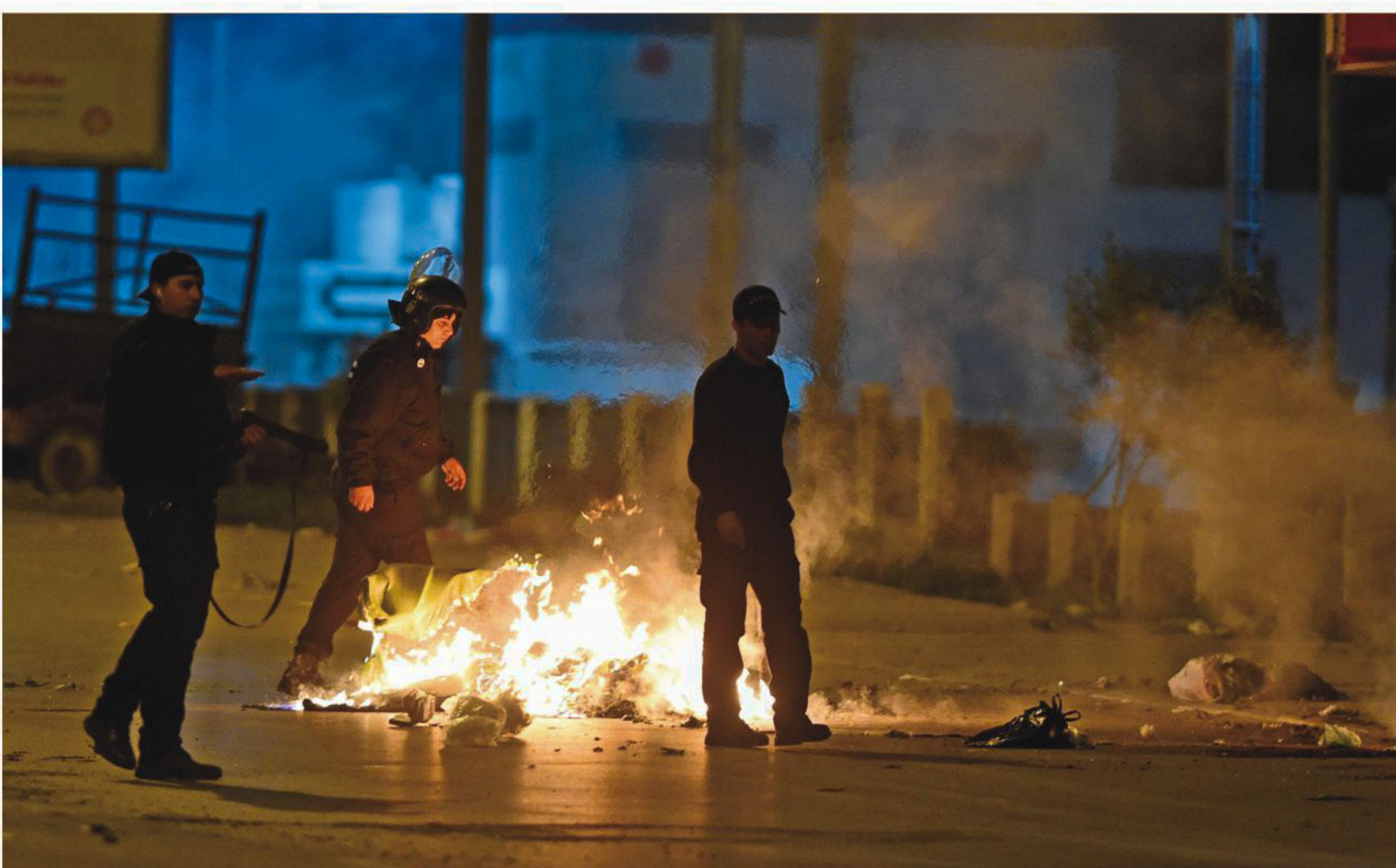
Tunisian security forces track down protesters in the Ettadhamen on the outskirts of Tunis late Wednesday, after price hikes ignited protests in the North African country. Hundreds have been arrested and dozens of police hurt during clashes, the interior ministry said, as anger over austerity measures spilled over into unrest.

"Young people are disappointed with the revolution, especially because of the high cost of living," she said.