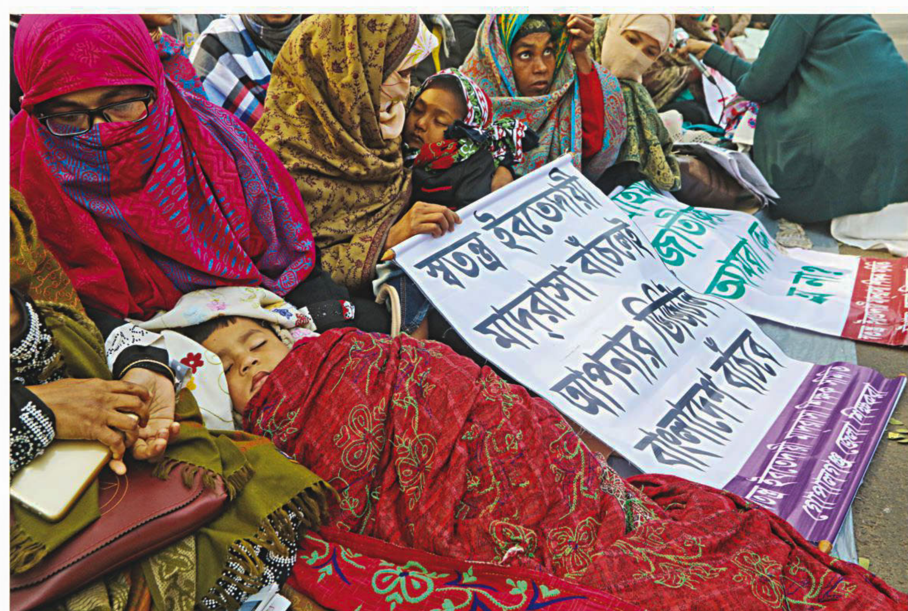
Ebteday madrasa teachers, some with their children, continue their sit-in for the eighth consecutive day yesterday in front of the capital's Jatiya Press Club, demanding nationalisation of all registered madrasas.