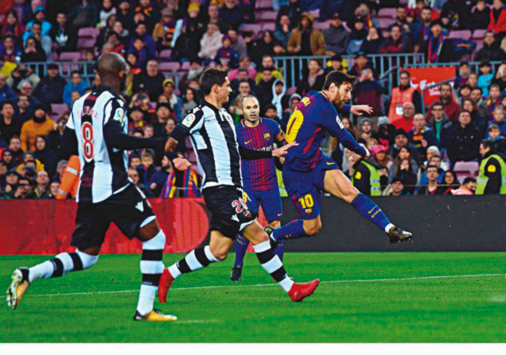
12 minutes into his 400th La Liga match for Barcelona yesterday, superstar Lionel Messi (R) fires home a sublime volley against Levante. It was the Argentine's 365th goal in Spain's top-flight.

And Barca rounded out the victory in the third minute of added time as Messi's low ball across goal at the end of a jinking run was turned in by Paulinho.