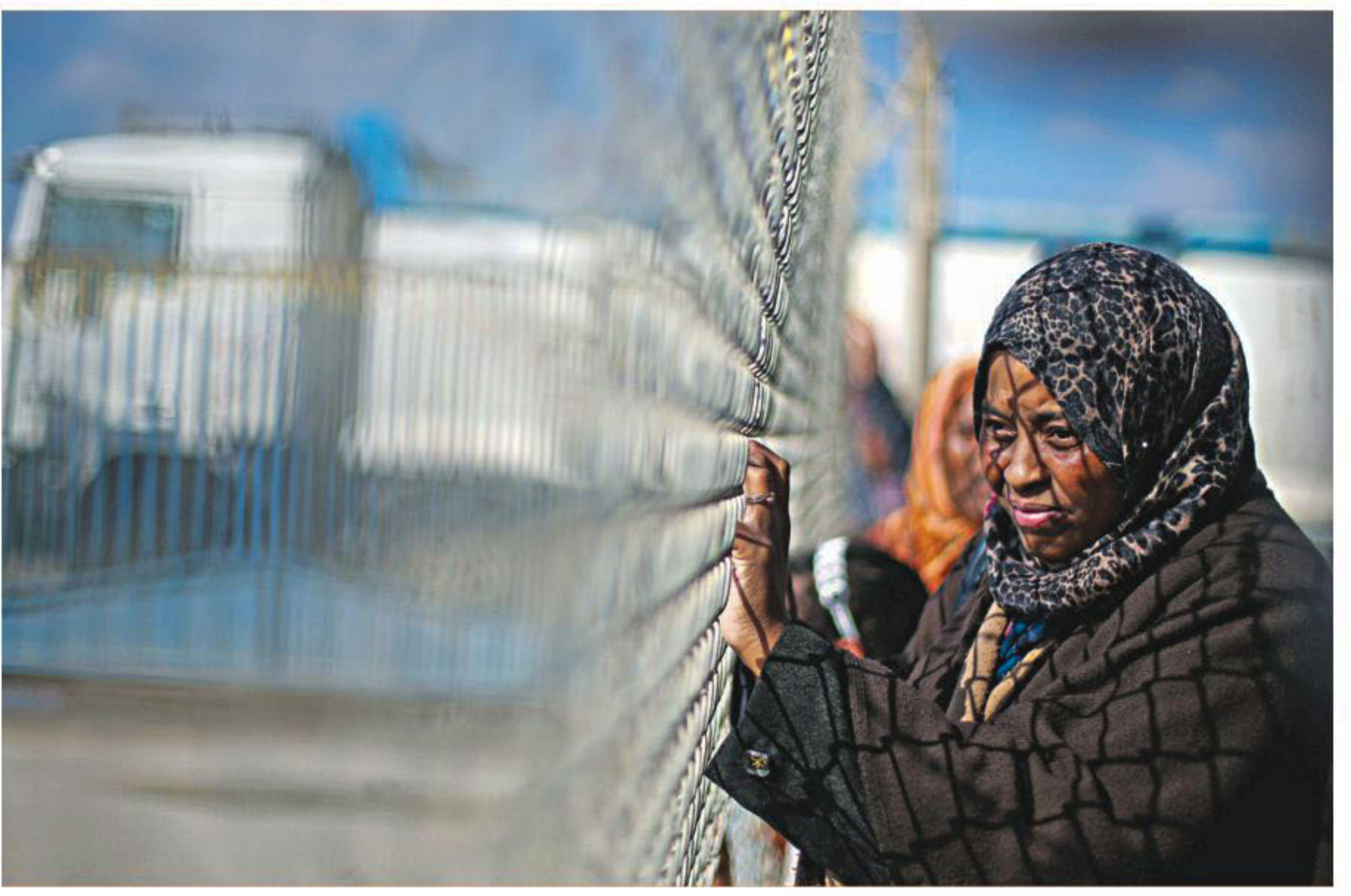
A Palestinian woman stands by a fence during a protest calling on Egypt to open Rafah border crossing, in the southern Gaza Strip yesterday.

35 people were killed in ceasefire violations by Pakistan last year