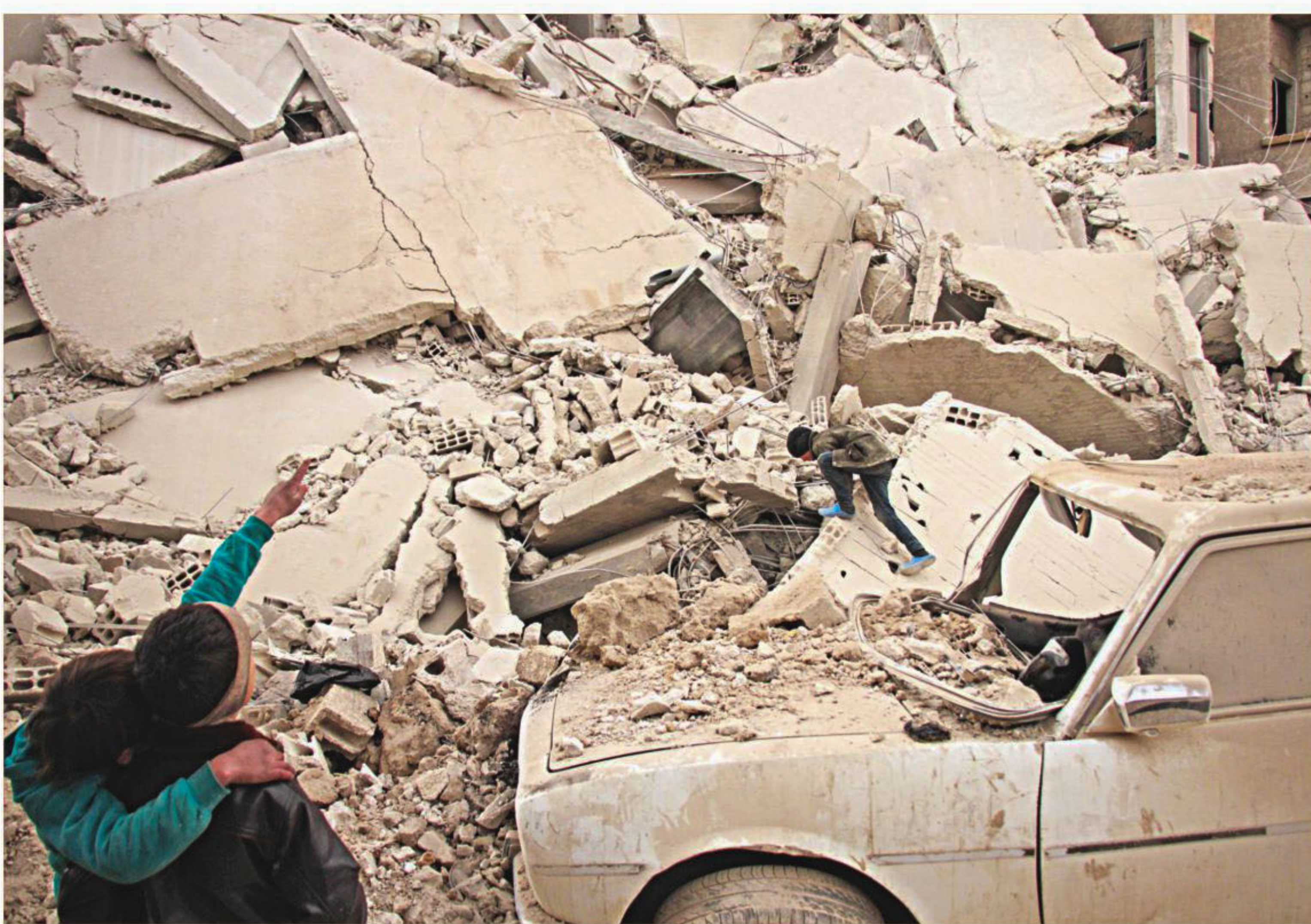
Syrian boys watch a boy walk amid destroyed buildings following bombardment a day earlier in the rebel-controlled town of Misraba, in the eastern Ghouta region on the outskirts of the capital Damascus, yesterday.