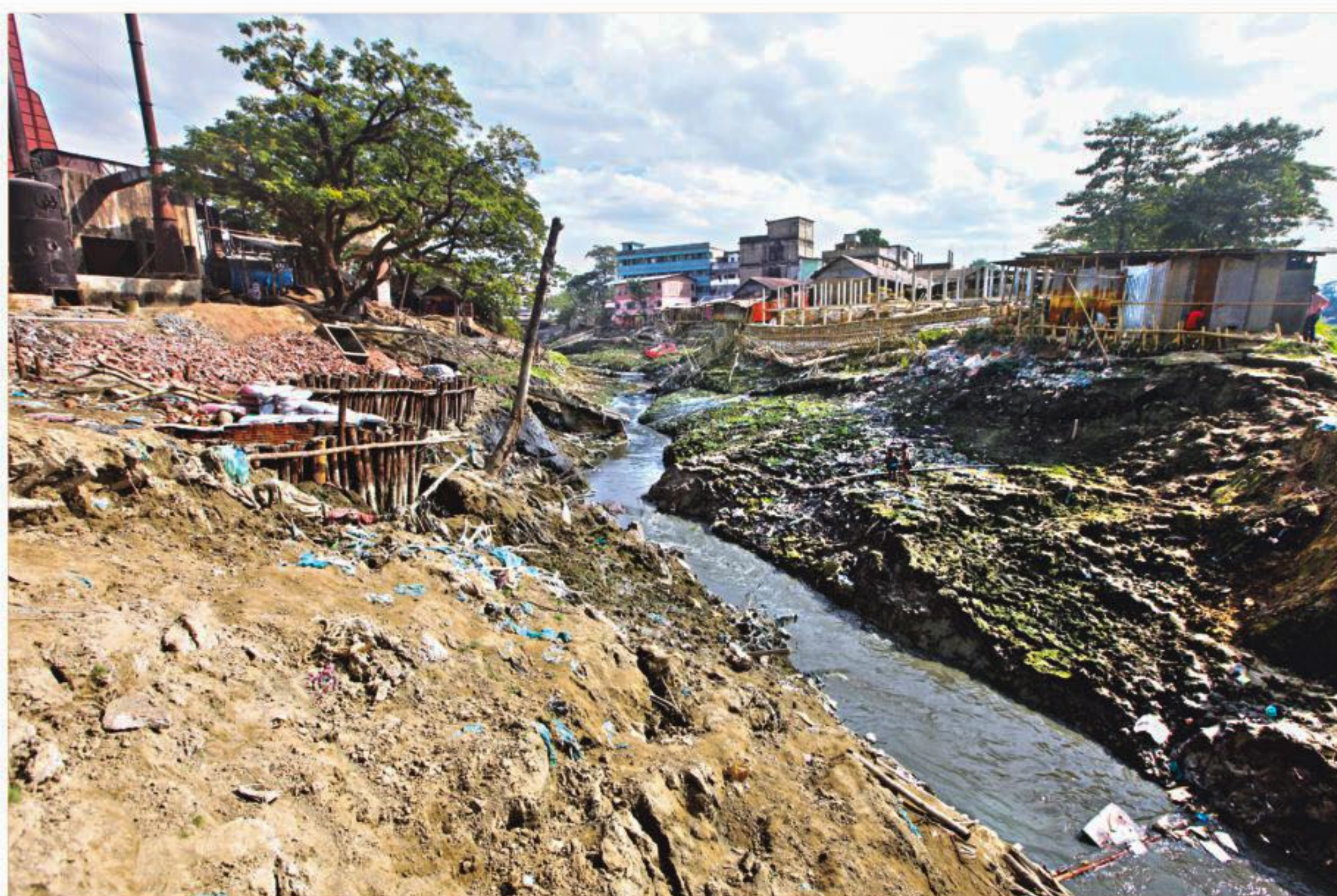
What appears to be an open drain used to be a wide canal called Gowali Chhara in Sylhet city. Crucial to saving the city from waterlogging, this five-kilometre-long canal is now in its death throes with littering and encroachment all around. The photo was taken yesterday.