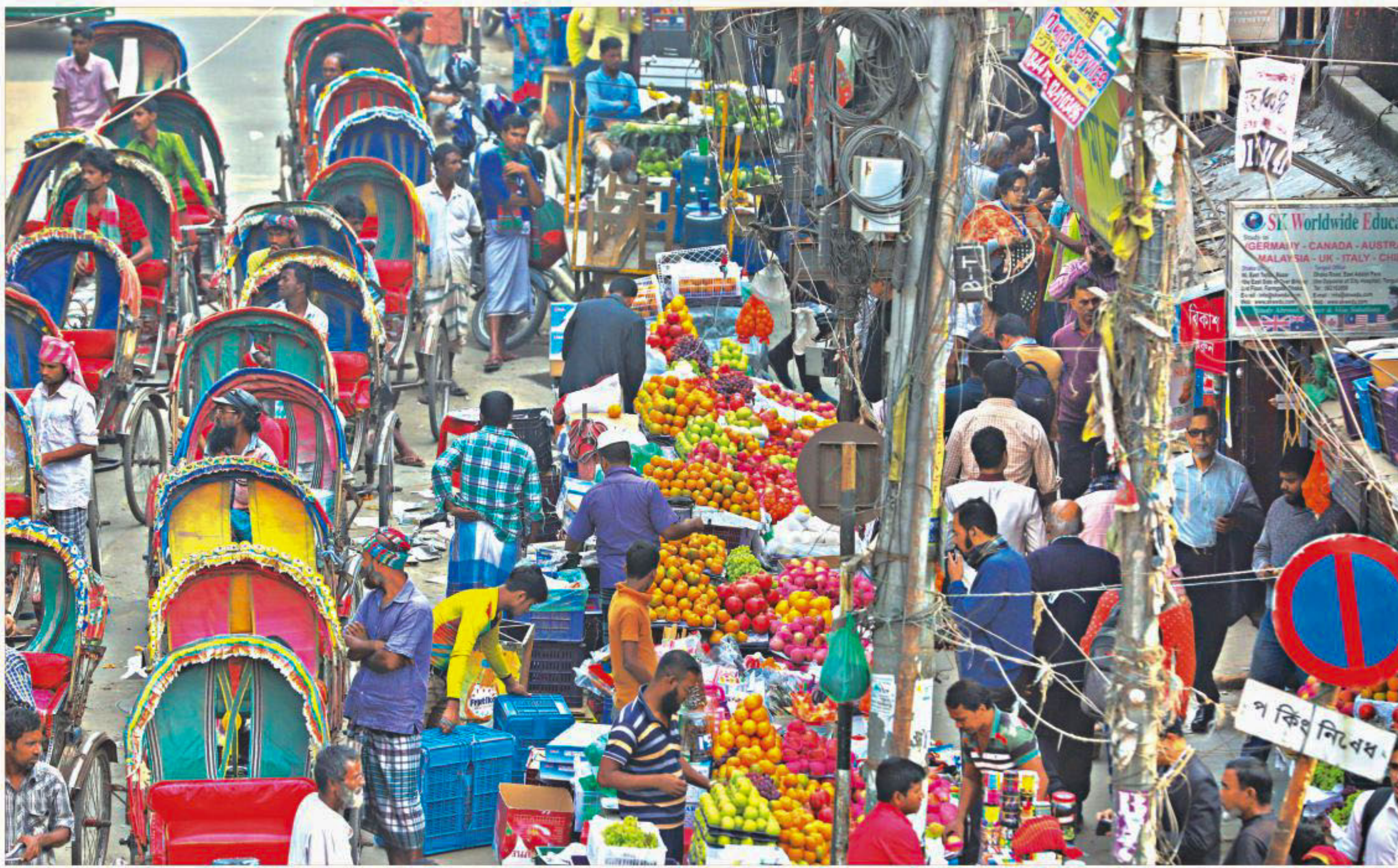
The road from the capital's Farmgate intersection toward Tejgaon rail gate via Govt Science College has become quite impassable. Getting on this road from the Farmgate end is the most difficult as this area remains occupied most of the time with makeshift stores and rickshaws. The photo was taken recently.

Justice Md Abdul Wahhab Miah of the Appellate Division has been discharging the duties of chief justice since October 3 last year, when then chief justice SK Sinha went on leave before finally stepping down.