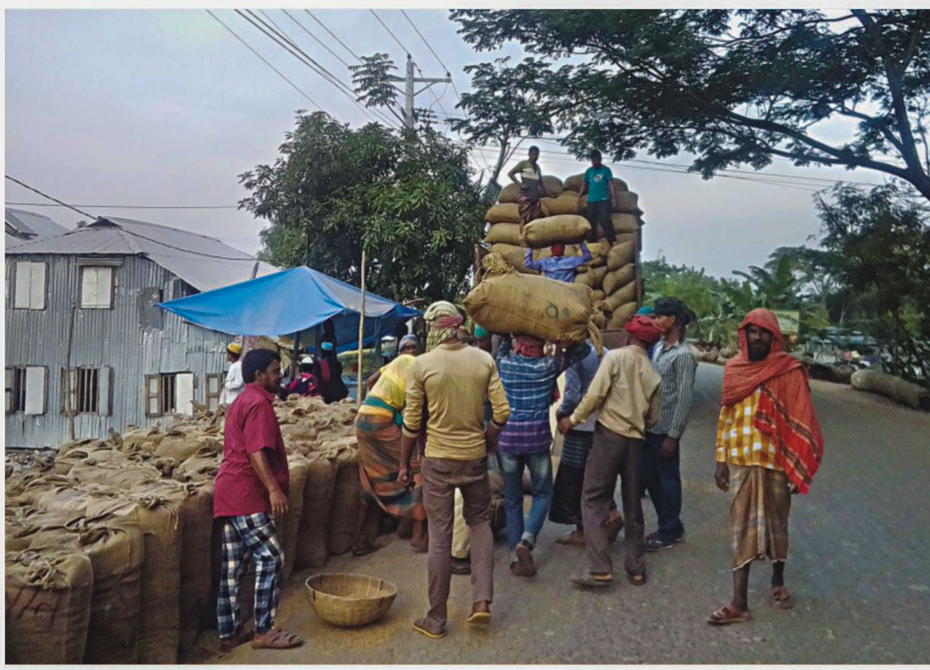
A section of local traders in Patuakhali's Kuakata area are seen loading Aman paddy on a vehicle to send it to mills in a northern district for husking.

If the government sets up the rice mill there local paddy growers will get fair price by selling their produce directly to the mill, he said, adding, the government will also be benefited by saving transportation cost.