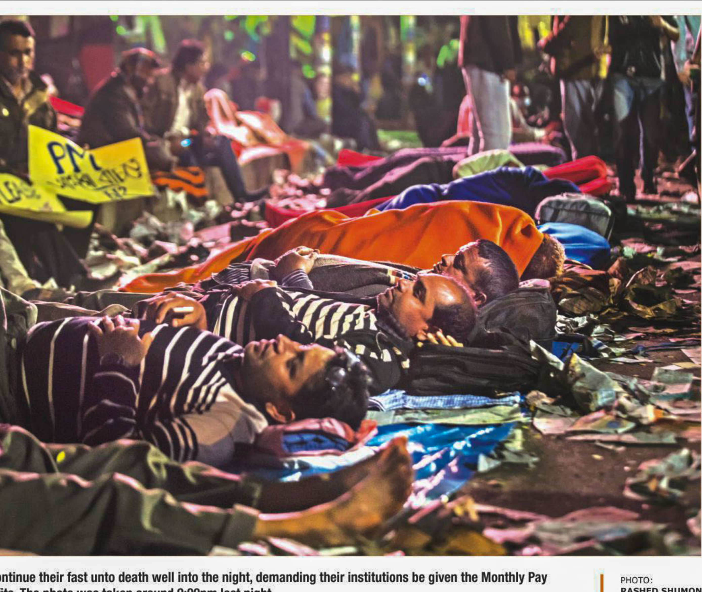
Teachers continue their fast unto death well into the night, demanding their institutions be given the Monthly Pay Order benefits. The photo was taken around 9:00pm last night.

EC discloses draft voter list; total voters 10.40cr STAFF CORRESPONDENT The next parliamentary election will have 2.30 crore more voters than the election in 2008 had. The current number of electorate is 10.40 crore, according to the draft voter list. The Election Commission disclosed the draft voter list yesterday and said the final voter list would be published on January 31. The data shows 2.30 crore people have been registered since the December 29, 2008, parliamentary election when 8.10 crore voters were eligible. The country had 9.19 crore voters during the 10th national election held on January 5, 2014. Most of the political parties boycotted that polls and 153 lawmakers were elected uncontested. Experts said the fresh voters will have an impact on the next parliamentary election and they could be the deciding factor. Former election commissioner SEE PAGE 2 COL 1