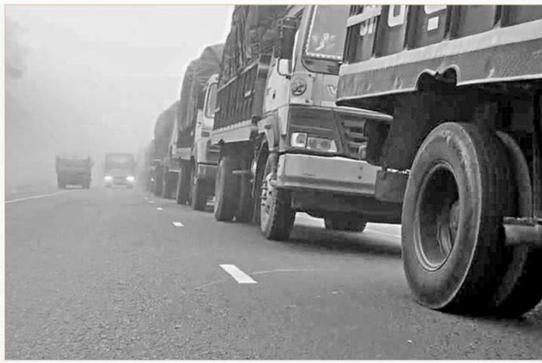
A large number of vehicles get stuck in long queues in Tangail yesterday as traffic movement through Bangabandhu Multipurpose Bridge remained suspended for over two hours due to poor visibility caused by dense fog.

Four ferries were stuck in the middle of Padma river while eleven ferries remained stranded at Daulatdia terminal and two ferries at Paturia.