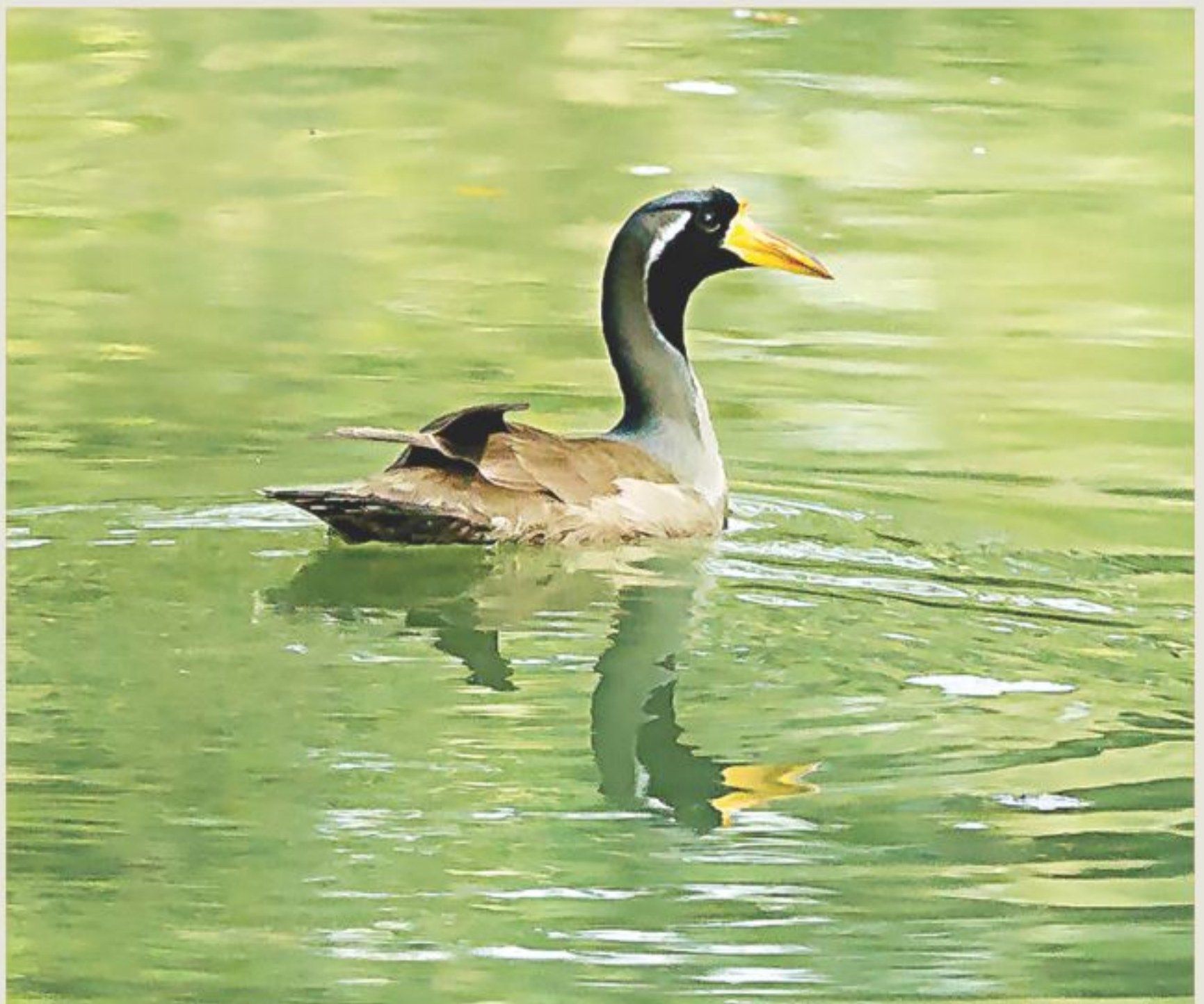
The ever mysterious Masked Finfoot.