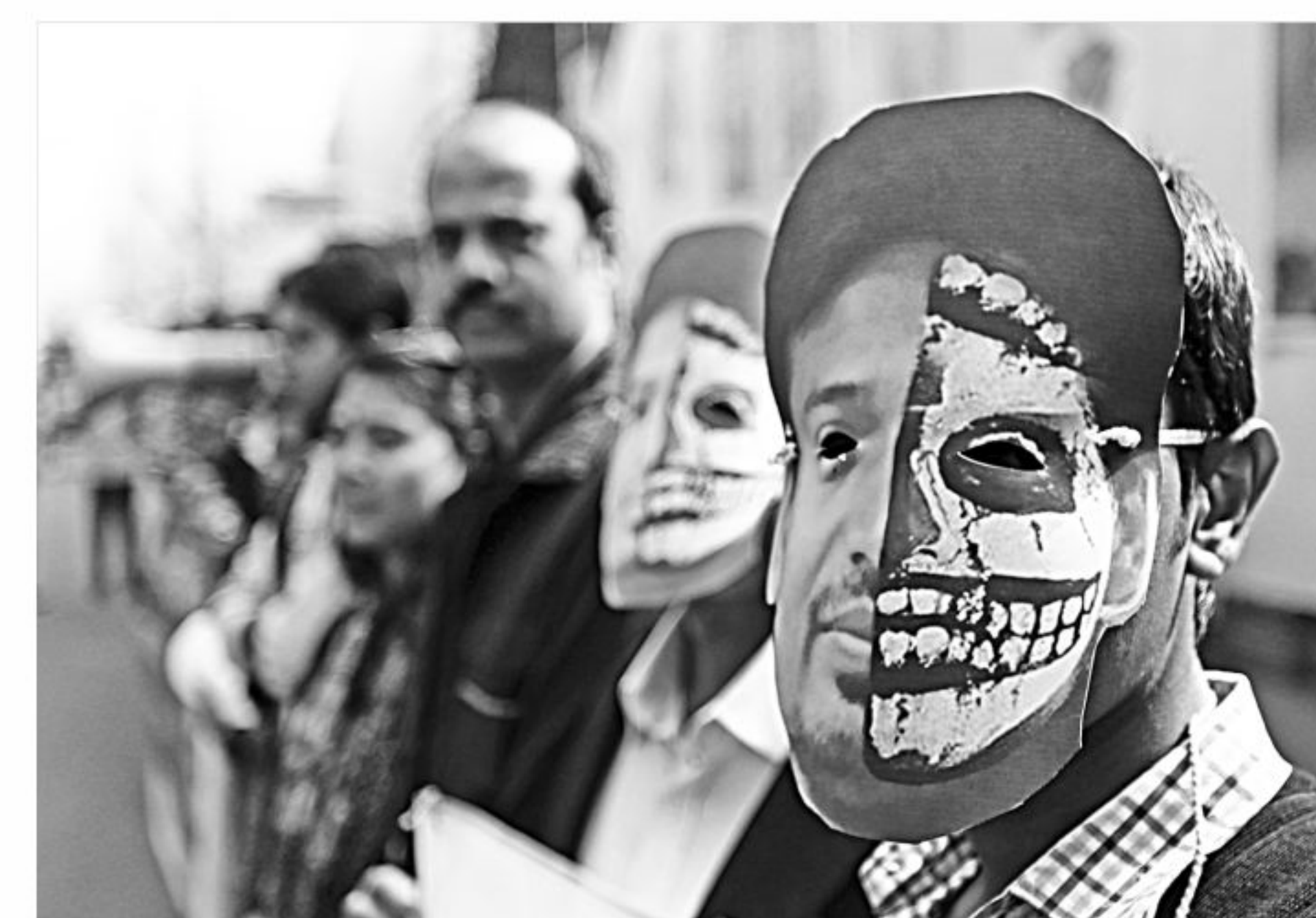
A participant wears a mask painted with a health warning image during an anti-tobacco human chain in front of the capital's Jatiya Press Club yesterday. The organisers, Bangladesh Anti-tobacco Alliance and Work for a Better Bangladesh Trust, demand that the tax policy be kept out of the "influence of tobacco companies", citing the country annually sees one lakh deaths caused by tobacco.