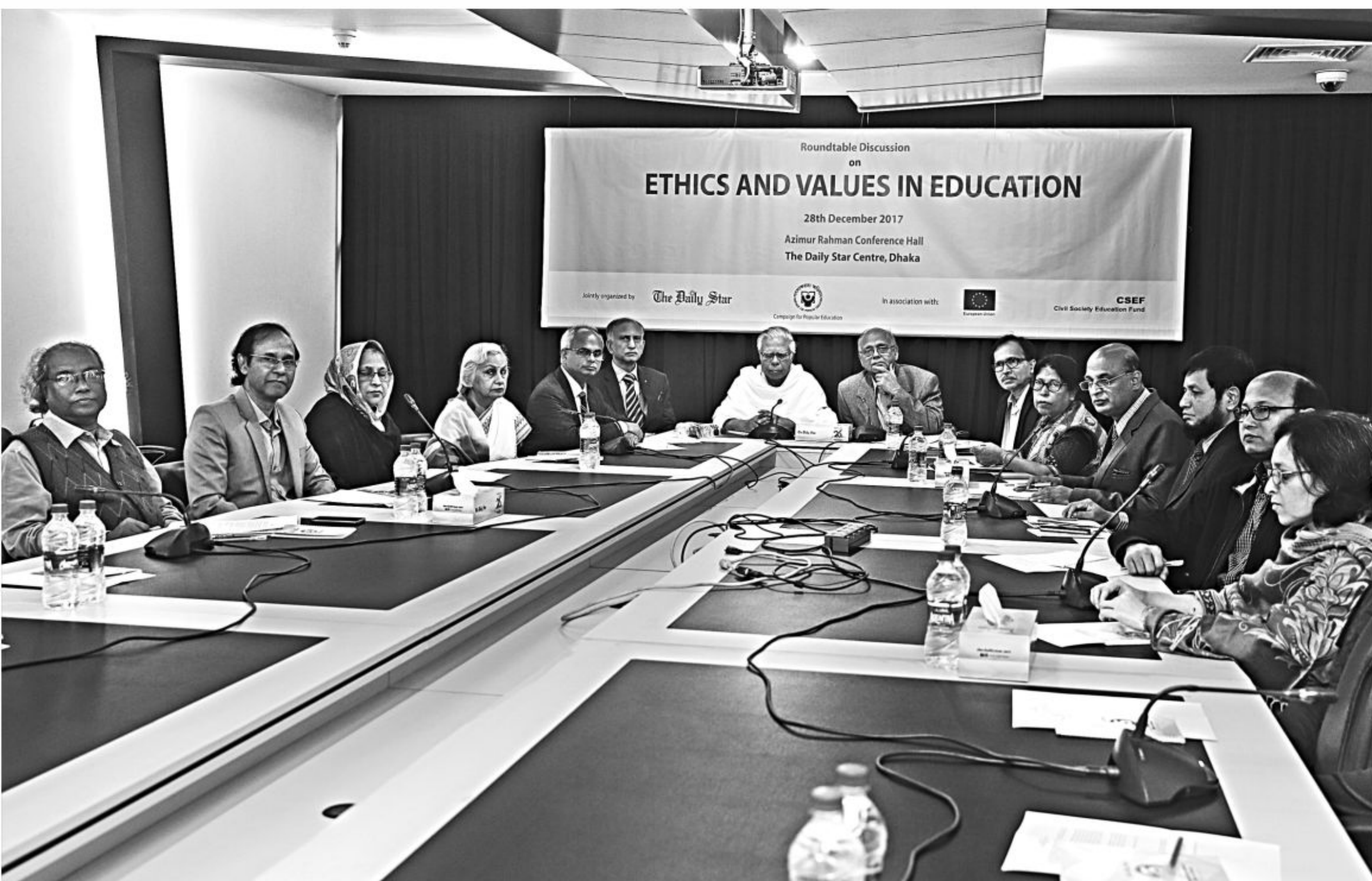
Participants at a roundtable discussion on “Ethics and Values in Education” at The Daily Star Centre yesterday. The Daily Star and Campaign for Popular Education (CAMPE) in association with the European Union and Civil Society Education Fund organised the programme. Story on Page 3.