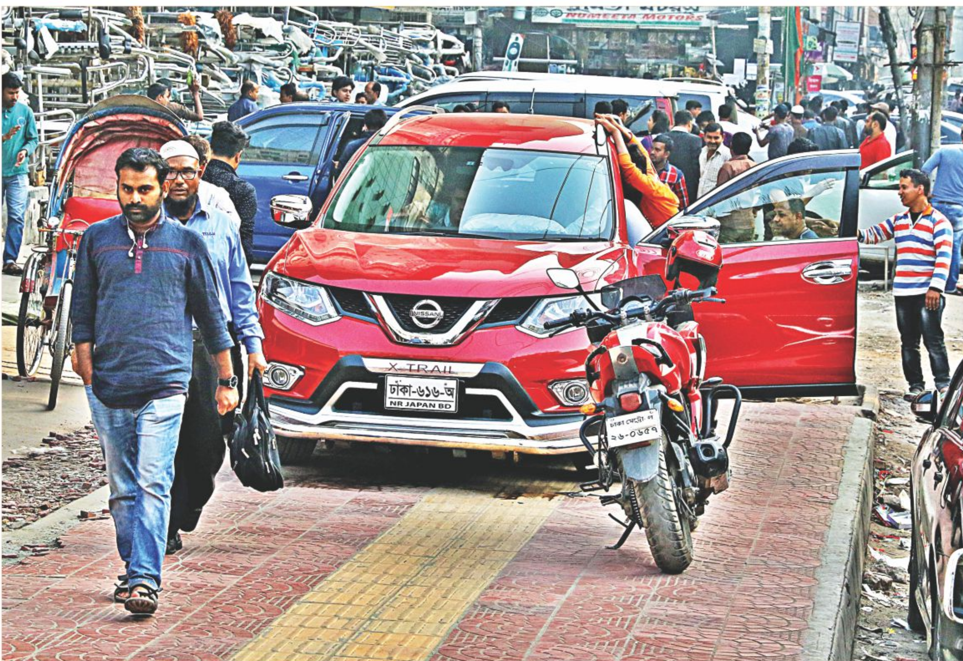
An SUV is parked on a newly paved footpath in Bijoy Nagar in the capital yesterday and work is being done in it. The vehicle is blocking the entire pavement and pedestrians were seen stepping on to the street to go around the vehicle. A motorbike is also parked next to it. See page 16 (City in Frame) for more photos on illegal parking and occupation of pavements.