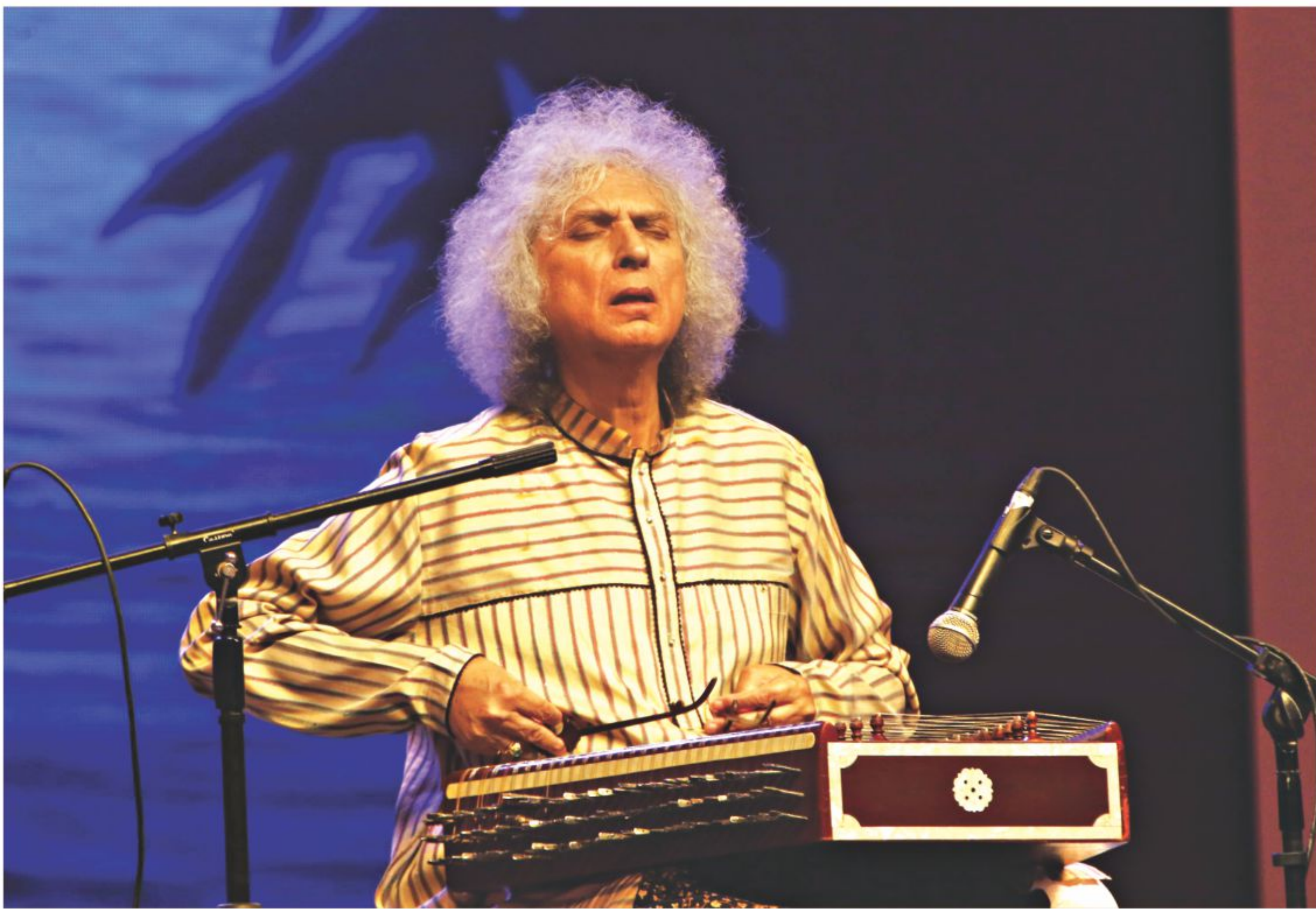
Pt Shiv Kumar Sharma, one of the biggest attractions of the festival, performs on the second night of Bengal Classical Music Festival at the Abahani grounds in the capital's Dhamondi.

UNB, Dhaka Scientists in Bangladesh have developed the country's first biotech rice variety giving farmers an answer to the difficulties they face in harvesting the staple with machines. Stems of BRRIdhan-86, the variety that got release approval yesterday, are strong and stout and easy to reap by mechanical harvesters. This will come handy to farm owners, who have dearth of labourers and also find it difficult to use harvesters. BRRI breeders told UNB that the new variety, with half a tonne of extra yield potential per hectare over the country's most produced rice variety BRRIdhan-28, is derived from Iranian rice variety Niamat through application of a biotech tool called anther culture. Anther culture, applied for the first time in rice science in Bangladesh, is a biotech plant culturing technique where SEE PAGE 2 COL 3