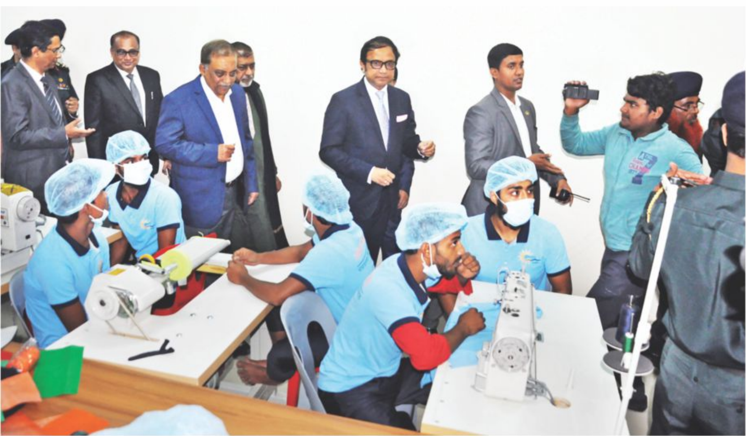
Home Minister Asaduzzaman Khan Kamal takes a tour of Bangladesh's first ever garment factory in prison. He formally inaugurated the factory set up inside Narayanganj District Jail yesterday morning. Half of the profit from the sales will be given to the prisoners who work at the factory.