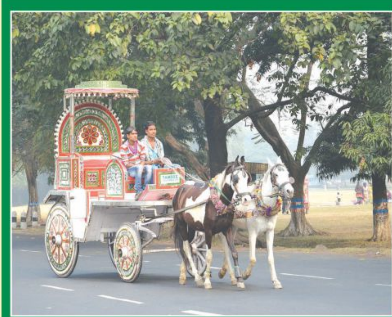
পুরান ঢাকার ঐতিহ্যবাহী ঘোড়ার গাড়ী