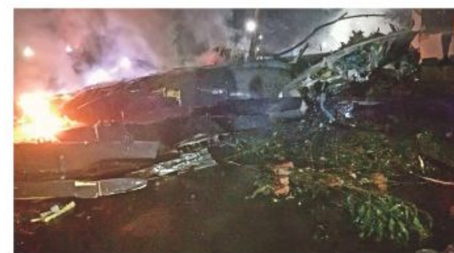
The burning wreckage of one of the Yak 130 aircraft.

The ISPR official said the two Yak 130 aircraft crashed around 6:30pm. They lost connection with the control tower at 6:15pm, around 15 minutes after they took off from Jahurul Haque Air Base in Chittagong.