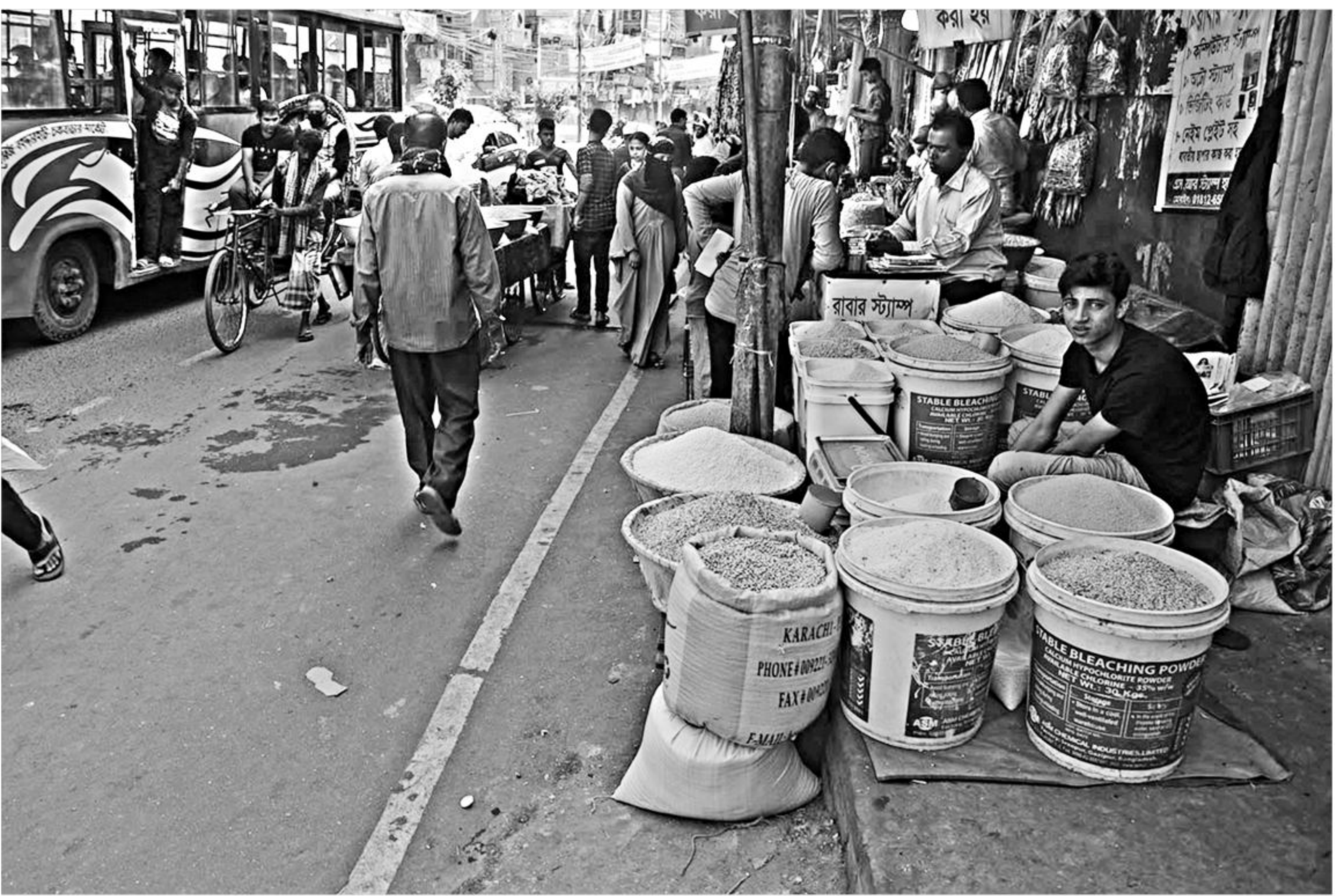
Most of the sidewalks in Chittagong's Andarkilla area, where the city corporation office is located, are now under the grip of all sorts of street vendors. From grocery items to rubber stamps -- everything is available there. As the sidewalks are not available to its rightful users, they are forced to get down on the streets, risking their lives. The photo was taken near Andarkilla Shahi Jame Masjid yesterday.