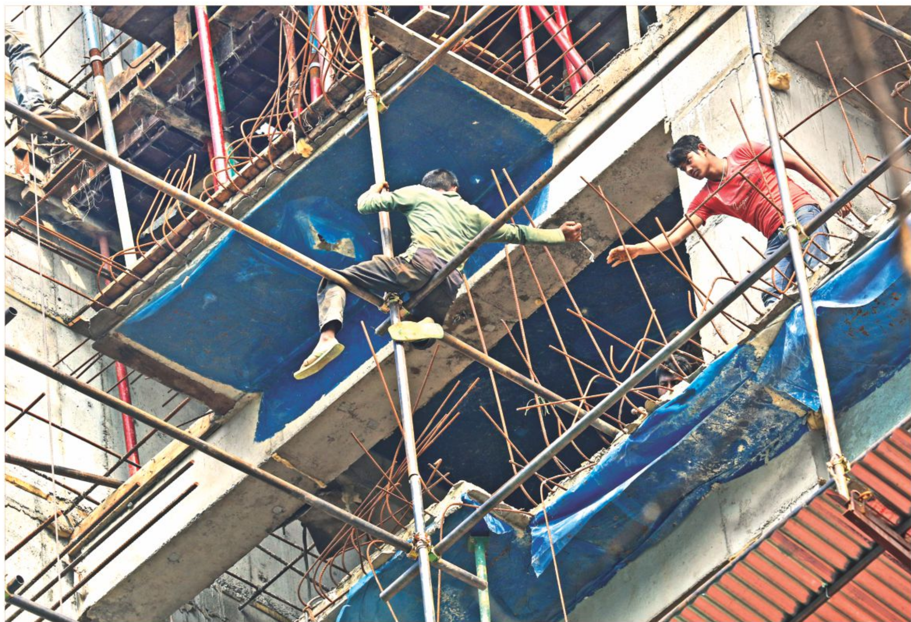
Without any safety gear, two labourers work at an under-construction high rise in the capital's Dhaka University area. At least 294 workers were killed and 101 others seriously injured in workplace accidents in the first three months of this year, according to a survey by Bangladesh Occupational Safety, Health and Environment Foundation. This picture was taken recently.