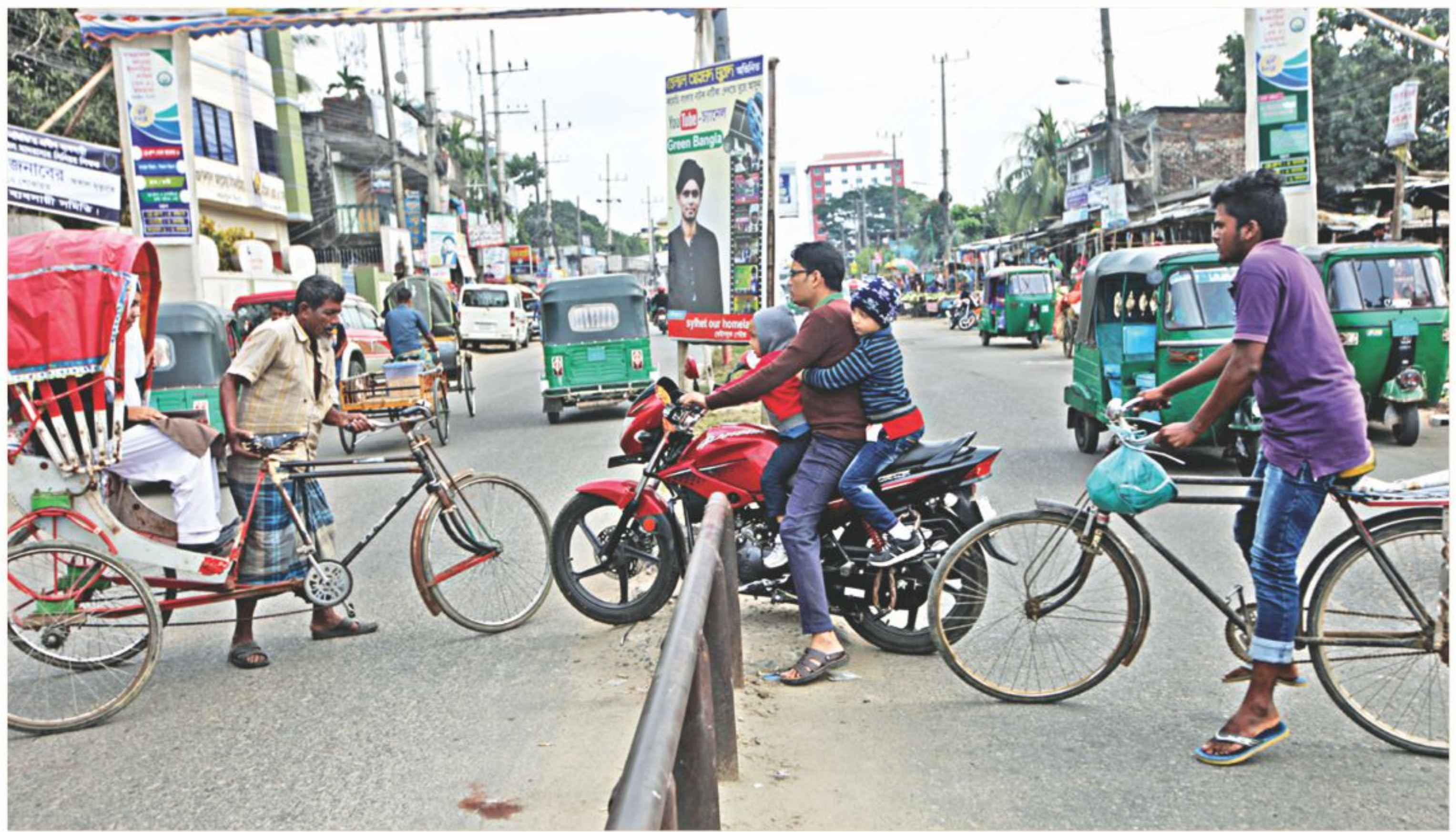
Discipline, order, patience and consideration for others -- these are increasingly becoming empty words among road users. In this photo taken from Madina Market area in Sylhet city yesterday, all sorts of vehicles are crossing the busy Sylhet-Sunamganj road by squeezing through a broken portion of the median.

The elite forces also seized militancy related books and pamphlets from Arif's possession, he added.