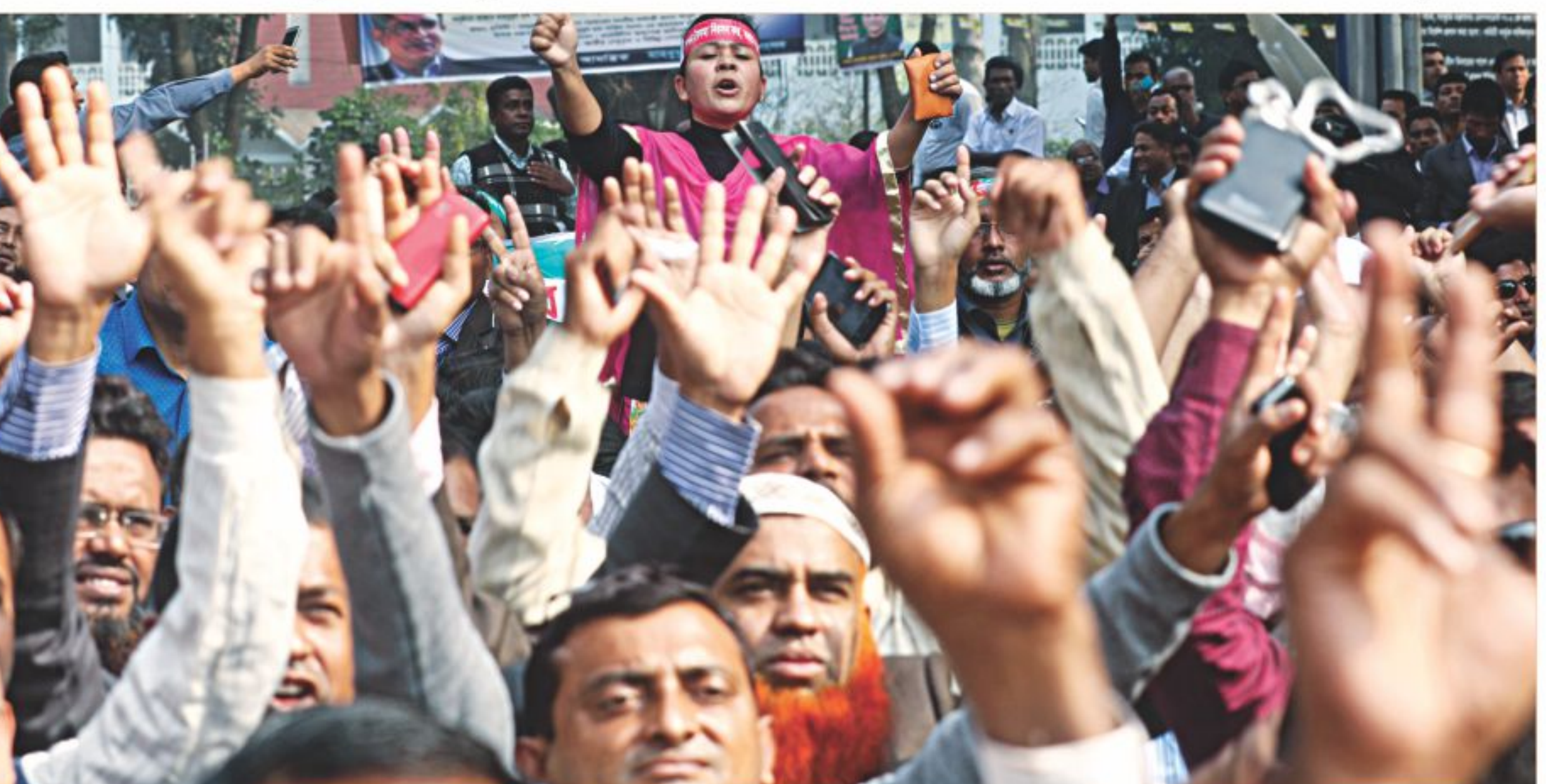
Assistant primary teachers yesterday demonstrate at the Central Shaheed Minar in the capital.

Assistant primary teachers' movement enters second day