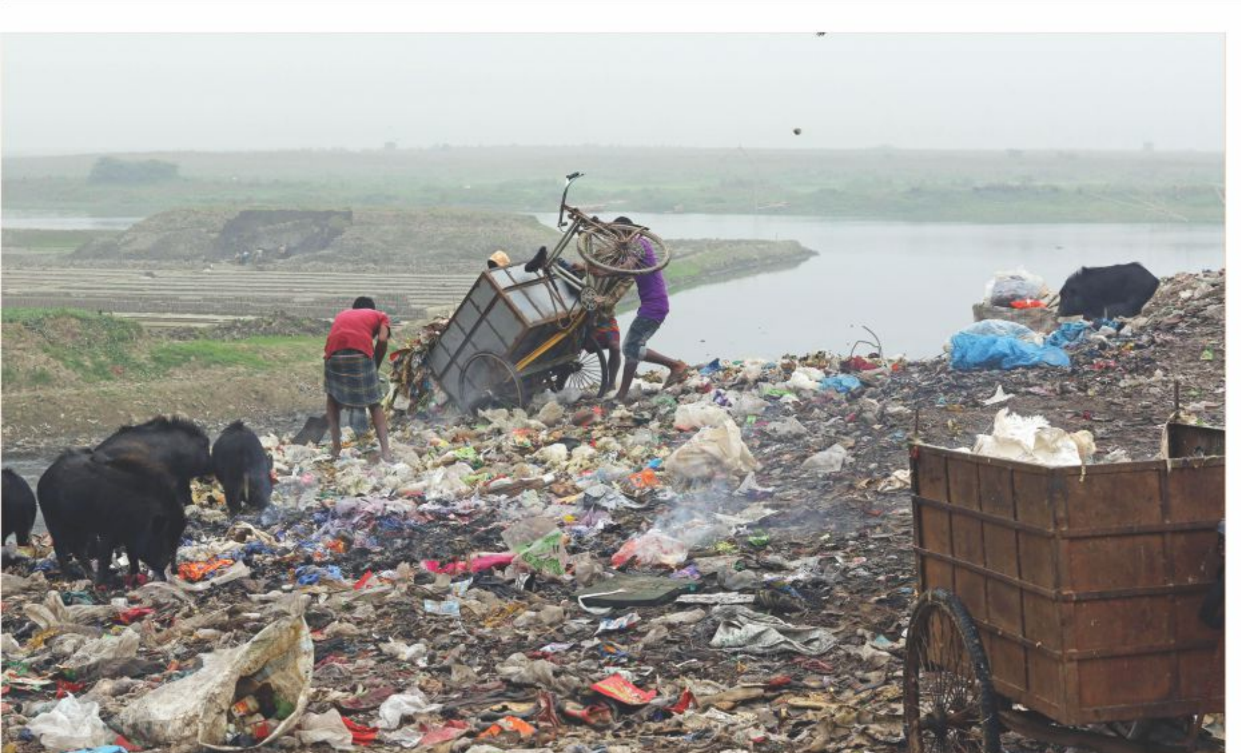
Garbage collectors emptying a van on the bank of the river Turag near Savar's Ashulia bridge. The river, a lifeline to Dhaka, is dying slowly due to unchecked dumping of waste and encroachment. The photo was taken last week.

This correspondent tried to get in touch with the director general of DPE for comments, but he did not answer his phone.