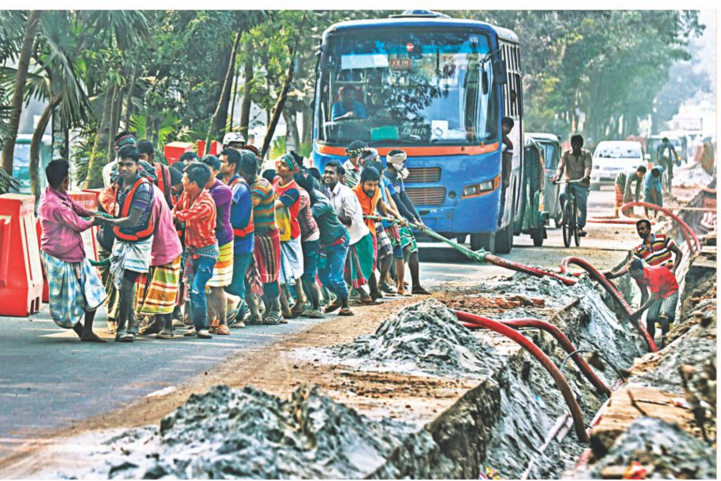
Vehicles backed up while workers relocate utility lines for the ongoing work of metro rail in the capital's Khamarbari area yesterday.