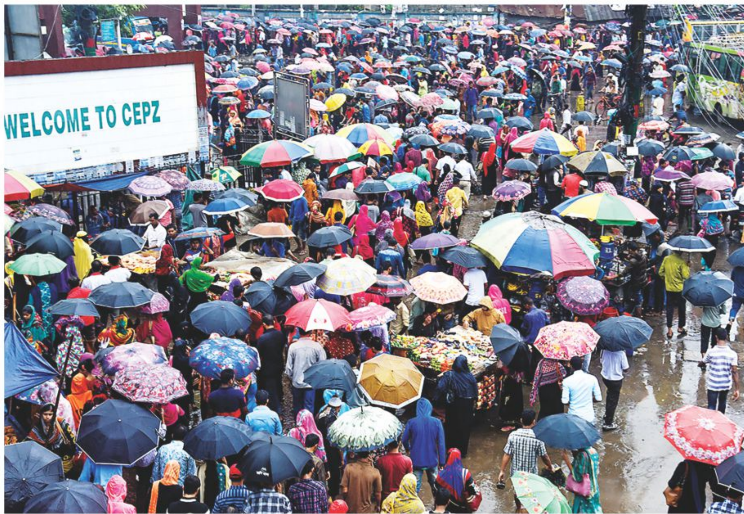
After a couple of days of gloom from a depression in the Bay, residents of the port city woke up to a rainy morning yesterday. In some parts, people slogged through ankle-deep water. The picture was taken at the CEPZ intersection.