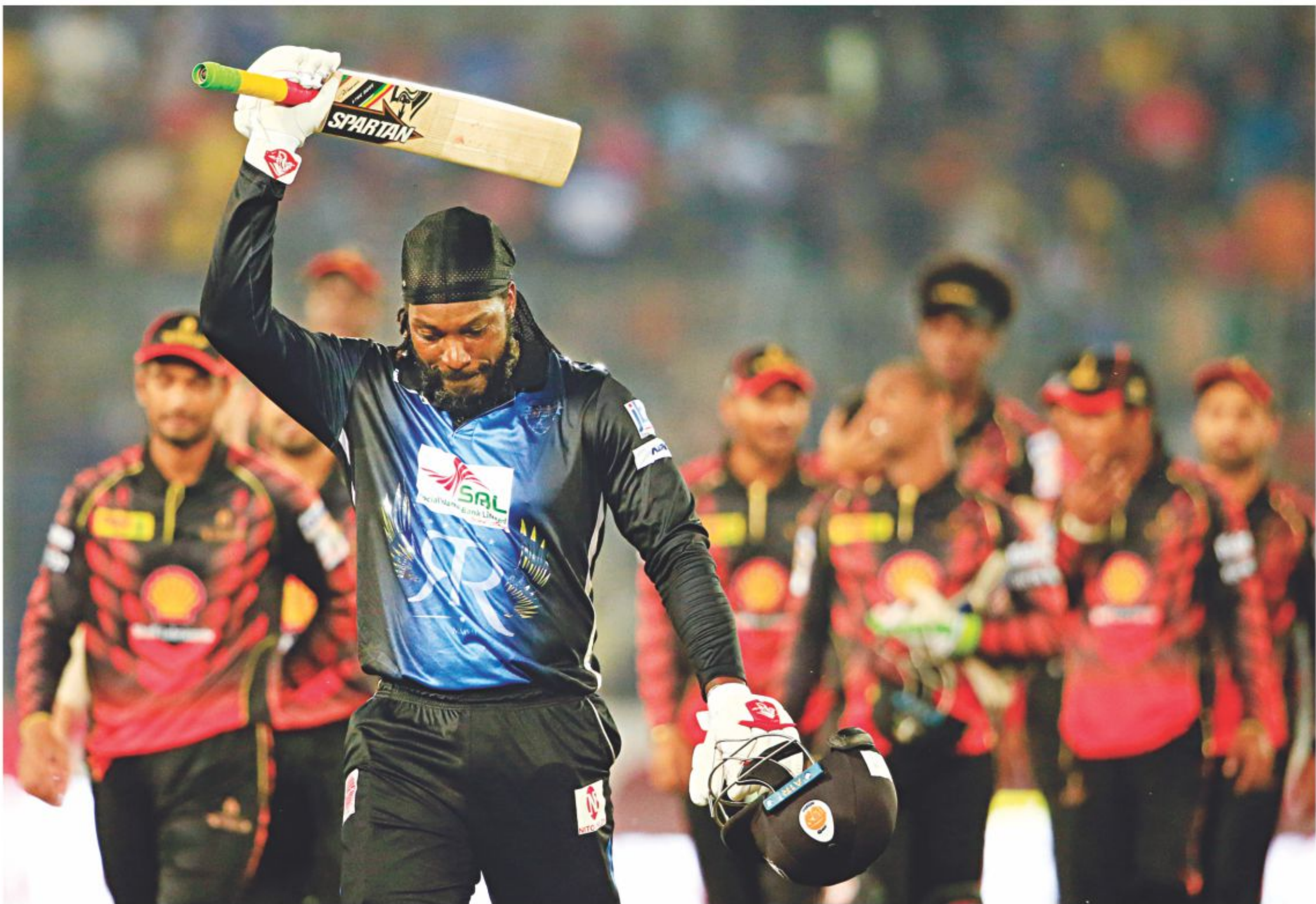
GAYLE STORM: Even the players of Khulna Titans, victims of Rangpur Riders batsman Chris Gayle's assault that put them out of the competition, could not help but admire the Jamaican after he reached his century in their Bangladesh Premier League Eliminator at the Sher-e-Bangla National Stadium yesterday.