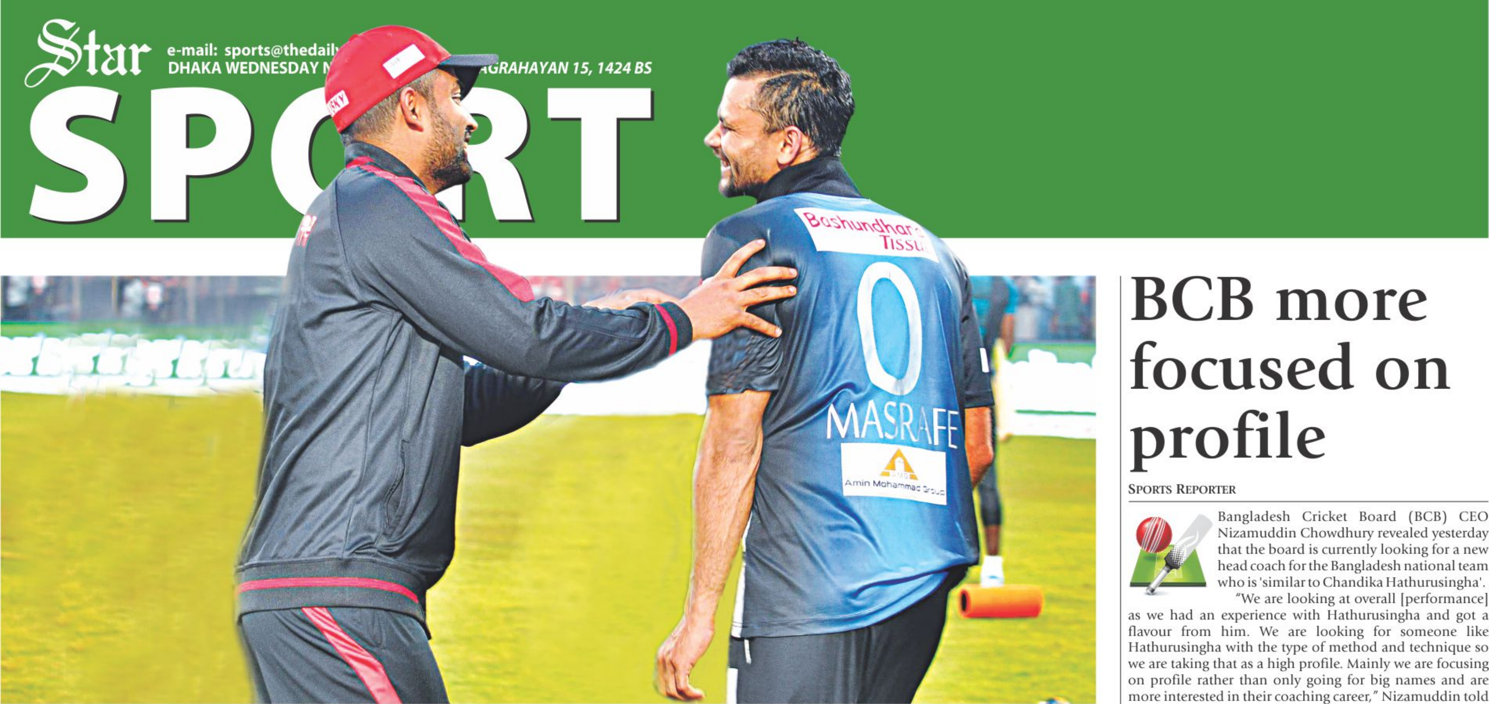
After leading his side to a four-wicket victory over Sylhet Sixers, Rangpur Riders skipper Mashrafe Bin Mortaza (R) shares a light moment with Comilla Victorians captain Tamim Iqbal, who later went on to lead his side to a nine-wicket drubbing of Khulna Titans in the BPL in Chittagong yesterday.