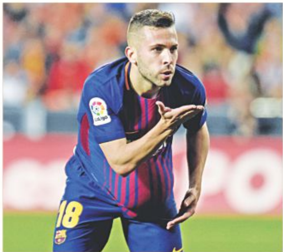
Barcelona defender Jordi Alba celebrates his equalising goal during their La Liga tie against Valencia at the Mestalla on Sunday.

Valencia had to wait just two minutes more to break the deadlock with Paris Saint-Germain loanee Guedes again heavily involved as he freed Jose Gaya down the left and his low cross was turned home by Rodrigo.