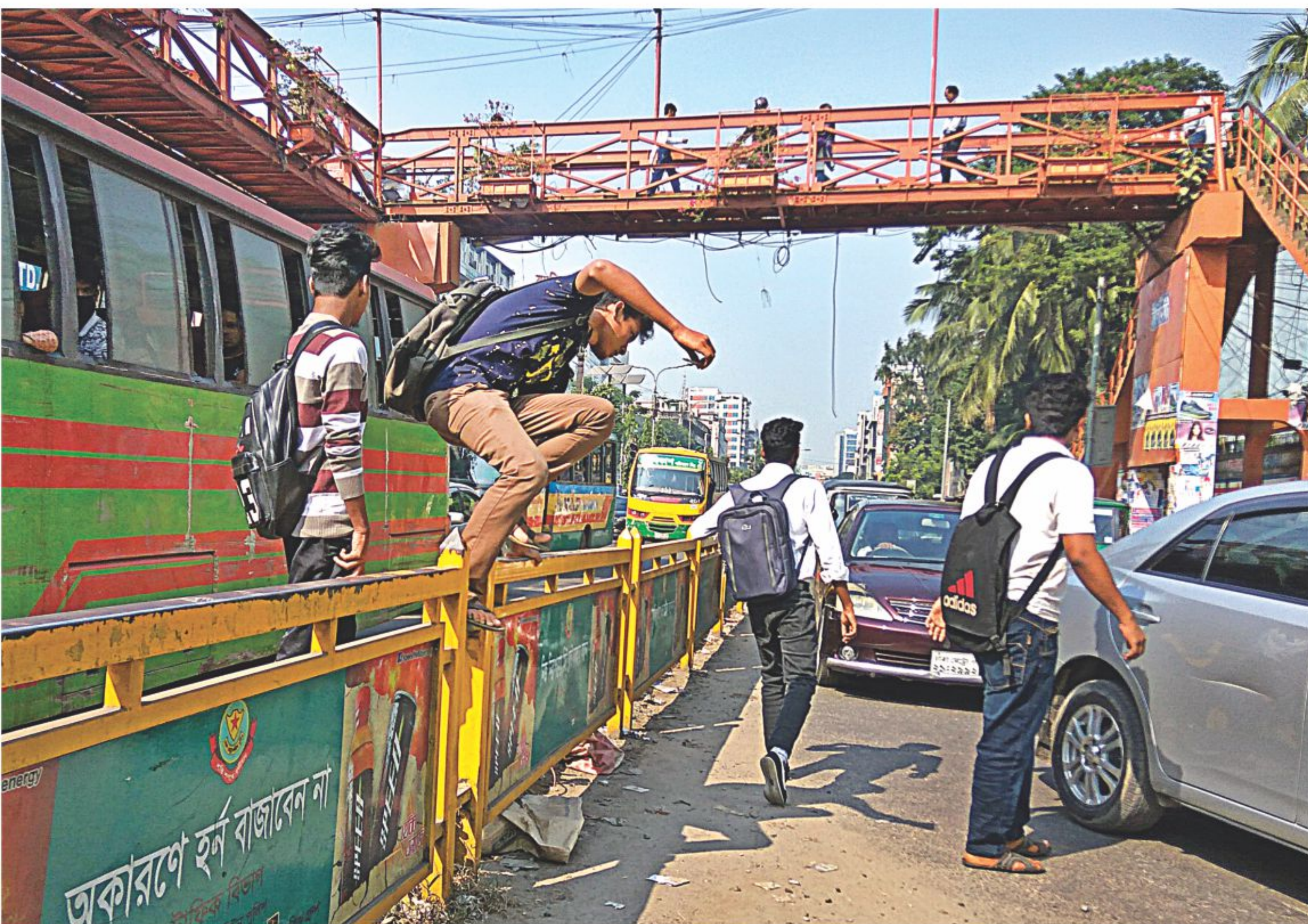
Jaywalkers, mostly students, climb over a fence at Science Lab intersection on Mirpur Road yesterday instead of using the footbridge a few yards away. They risk accidents and force vehicles to slow down just to avoid climbing stairs.