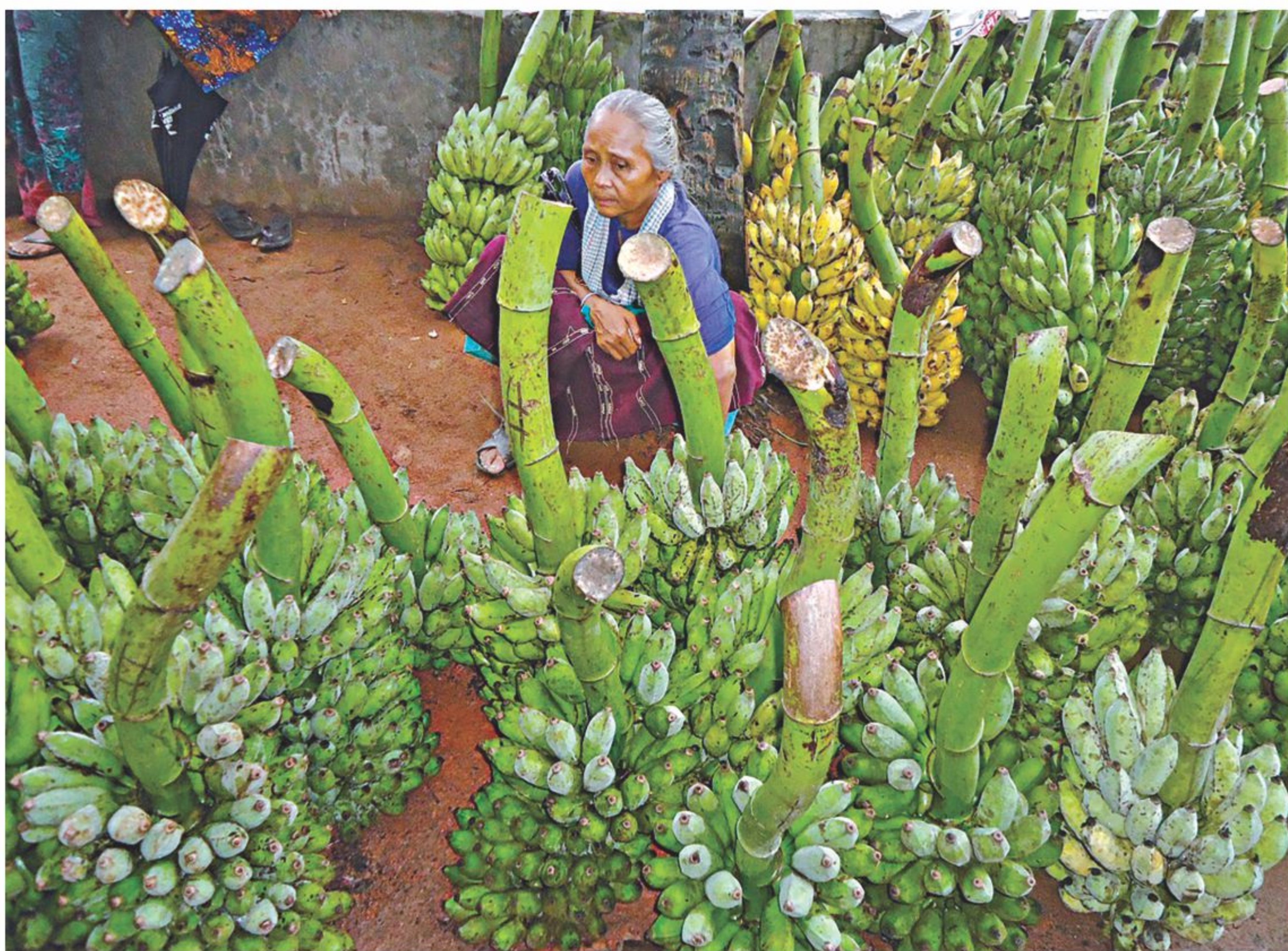
Organic bananas being sold at a Bandarban market recently. Growers have had a good yield this year.