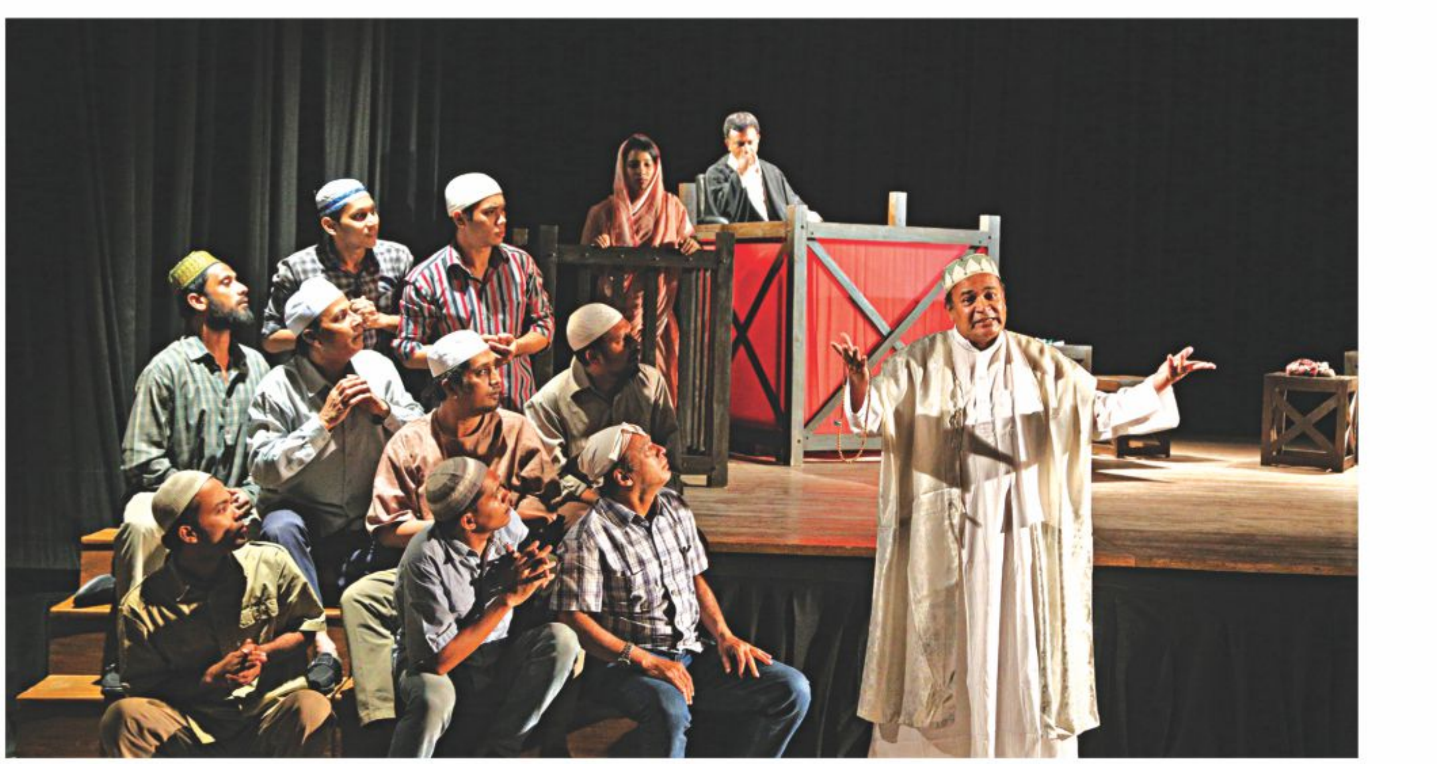
A scene from "Tarangabhango".