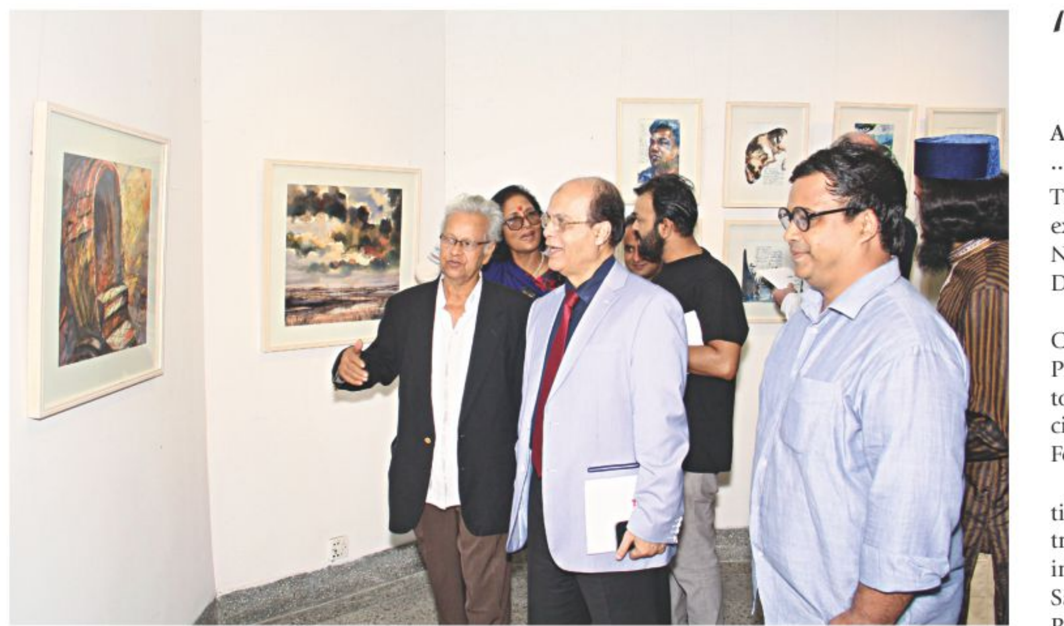
Guests at the inauguration of the exhibition.

About his work in cinema, Zahid Hasan says "I do want to work in films, but only if everything clicks - the story, the character. That is why I did 'Haldaa'; the viewers will realise when they see the film why I did it."