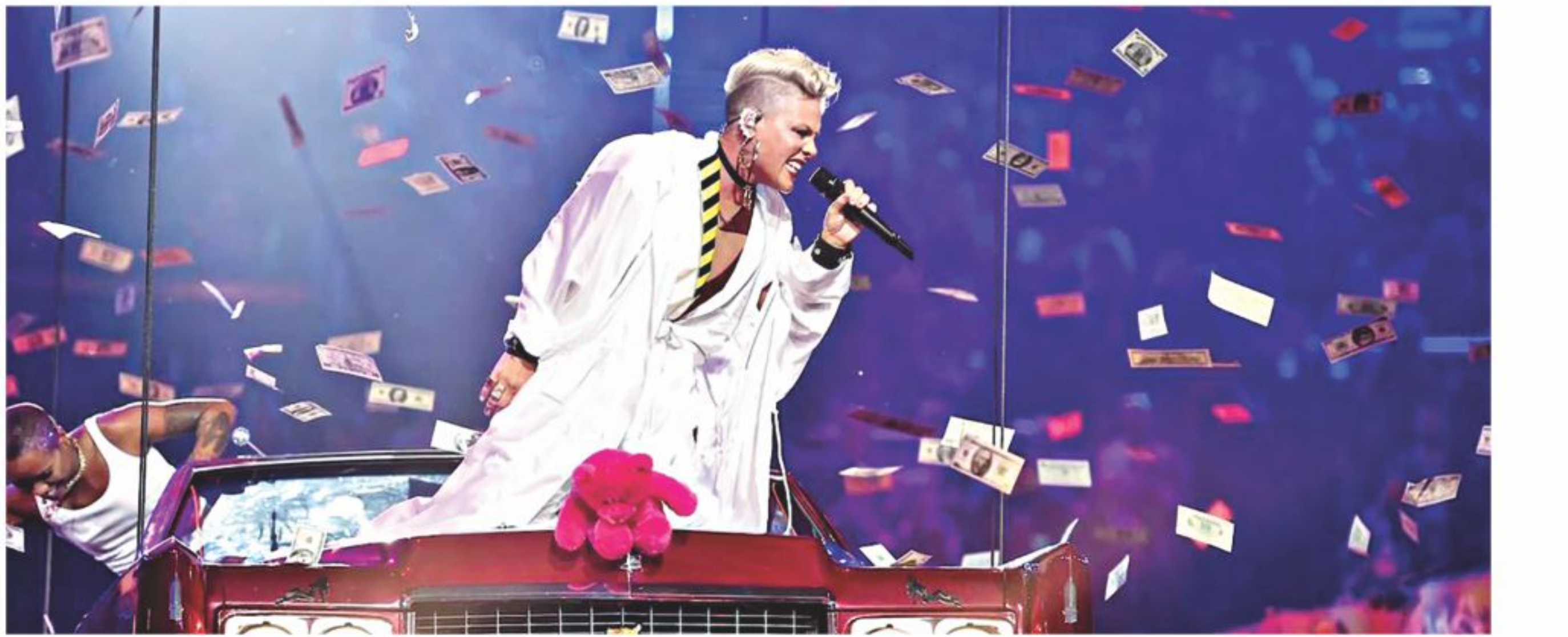
Pink delivers a powerhouse solo performance at the ceremony.

The 2017 American Music Awards were packed with more than a dozen amazing performances on Sunday night, but after all the confetti had fallen and Pink was lowered down from the side of that hotel in Los Angeles, Bruno Mars, Keith Urban and Luis Fonsi's "Despacito" were the night's biggest award winners.