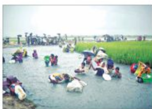
Photo Exhibition Shoragoto Organiser: Prothom Alo Venue: Gallery 5, National Art Gallery, BSA Date: November 17-24 Time: 11am-8pm

Group Print Exhibition Title: Nature Quest Venue: Gallery Cosmos, H-115, L-6, New DOHS, Mohakhali Date: Nov 10-23 Time: 11am-8pm