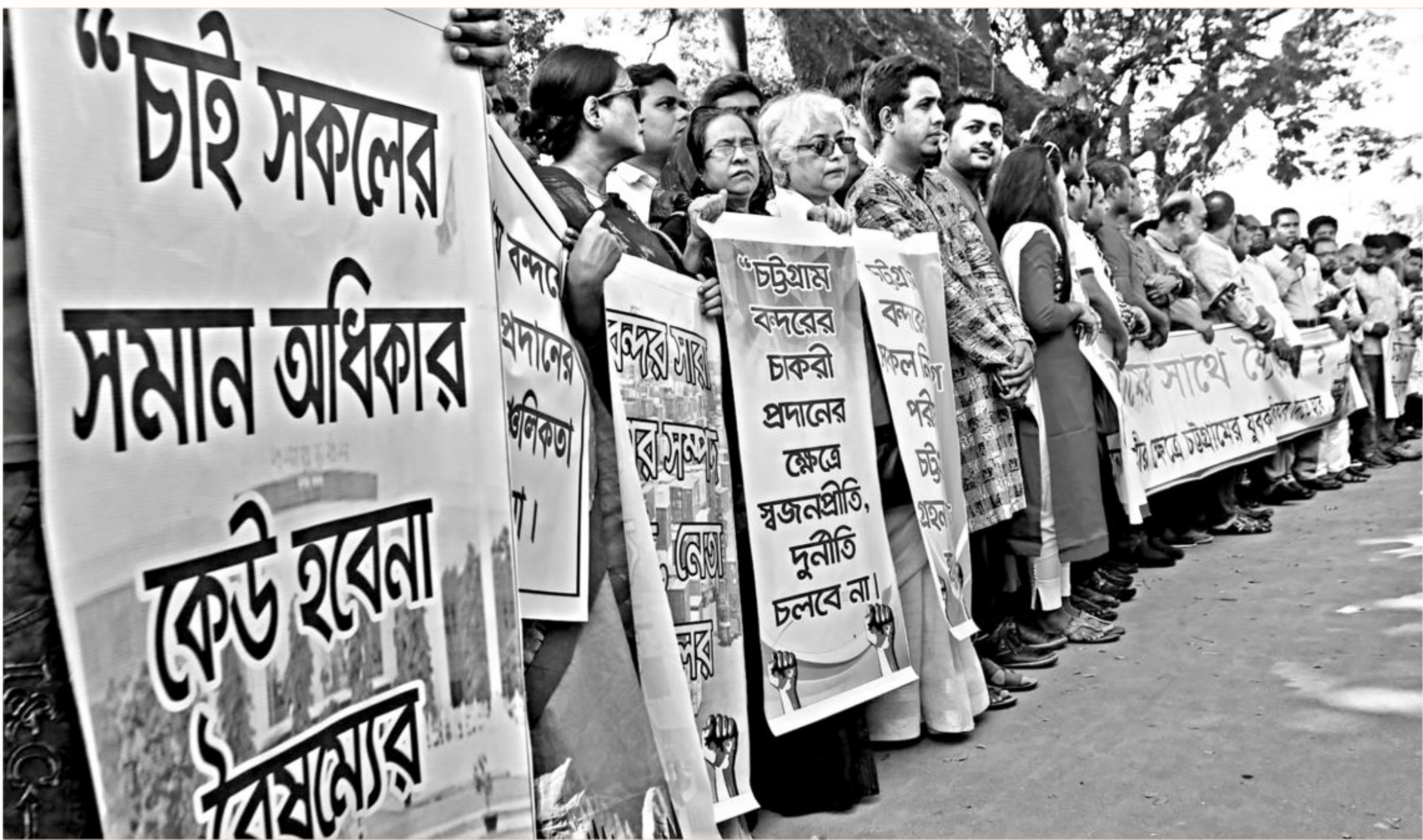
Bringing an allegation of nepotism and irregularities in a recent recruitment test for the post of Laskar (class IV employees) at Chittagong port, some people formed a human chain in front of the Bandar Bhaban yesterday. The protesters, mostly local leaders of the ruling party and its student wing, under the banner of "Aamra Chhattagrambasi" (We, the residents of Chittagong), demanded cancellation of the tests. They alleged that applicants from Chittagong faced discrimination as only a handful of them got recruited.