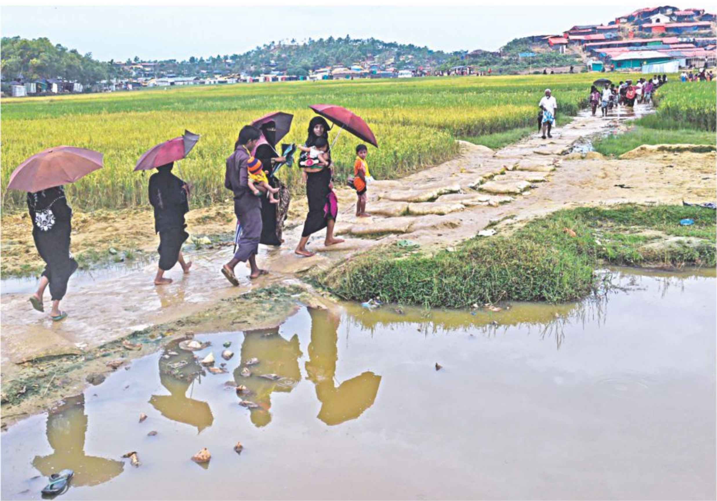
Rohingya refugees walk with umbrellas during a drizzle at Thankhali refugee camp in Ukhia of Cox's Bazar yesterday. An estimated 618,000 Rohingya have fled Myanmar since a military crackdown was launched in Rakhine in late August.