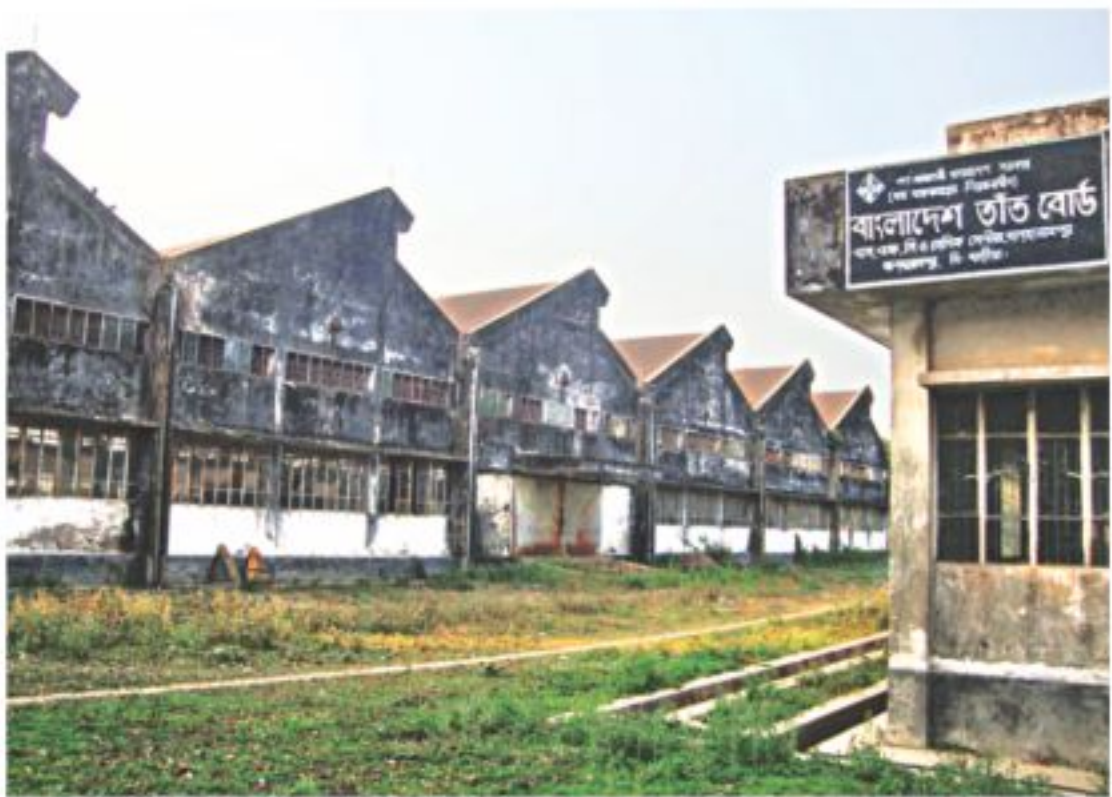
A weaver at work in Bancharampur of Brahmanbaria. Weavers in the upazila's 32 villages are leaving the profession. Only around 4,000 handlooms are in operation now. Bottom , the training centre of Bangladesh Handloom Board in Bancharampur lies empty as there are no students anymore. The photos were taken recently.