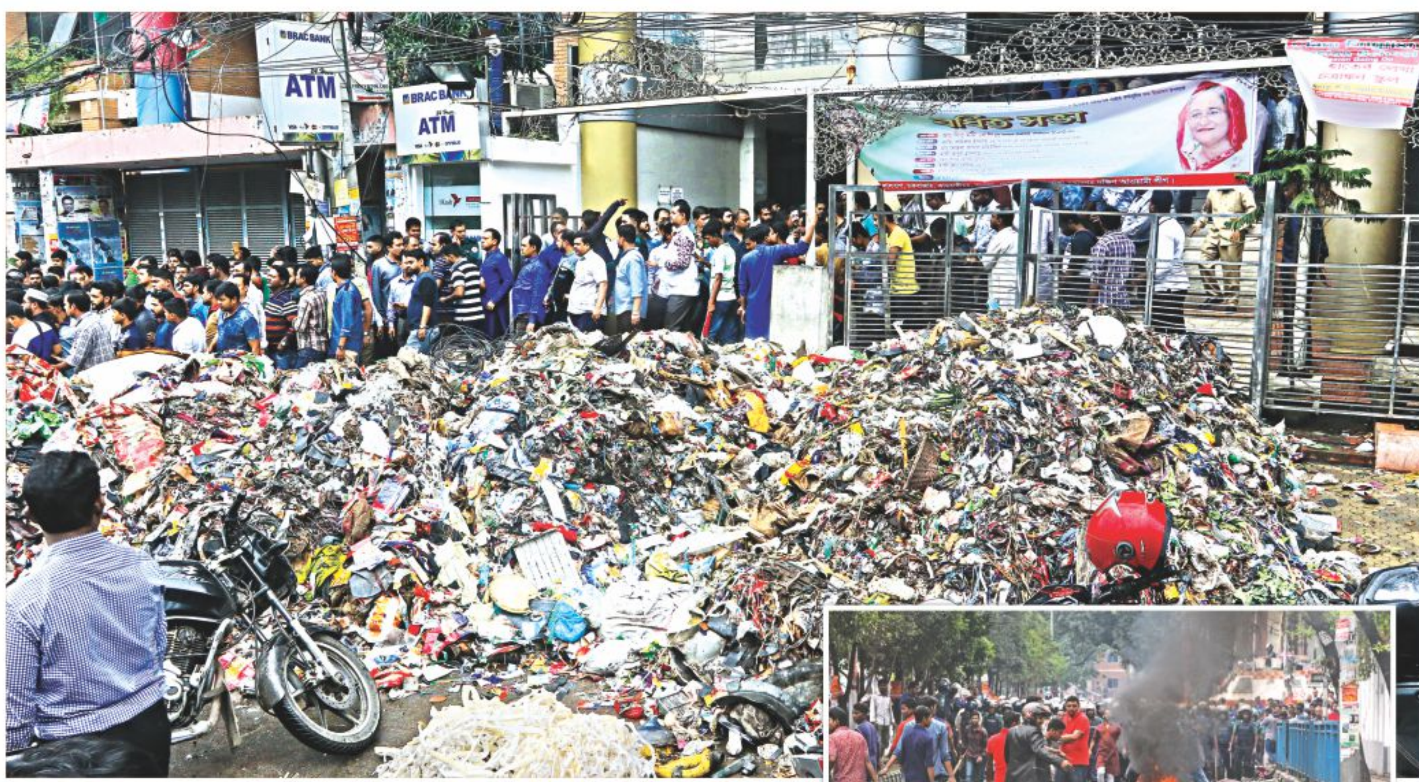
Heaps of garbage in front of a community centre in Azimpur yesterday. A group of Dhaka City Awami League leaders said their rivals dumped the rubbish the previous night to foil a party programme inside the community centre. Inset, a motorcycle is set on fire during a clash between the two AL groups over the incident.