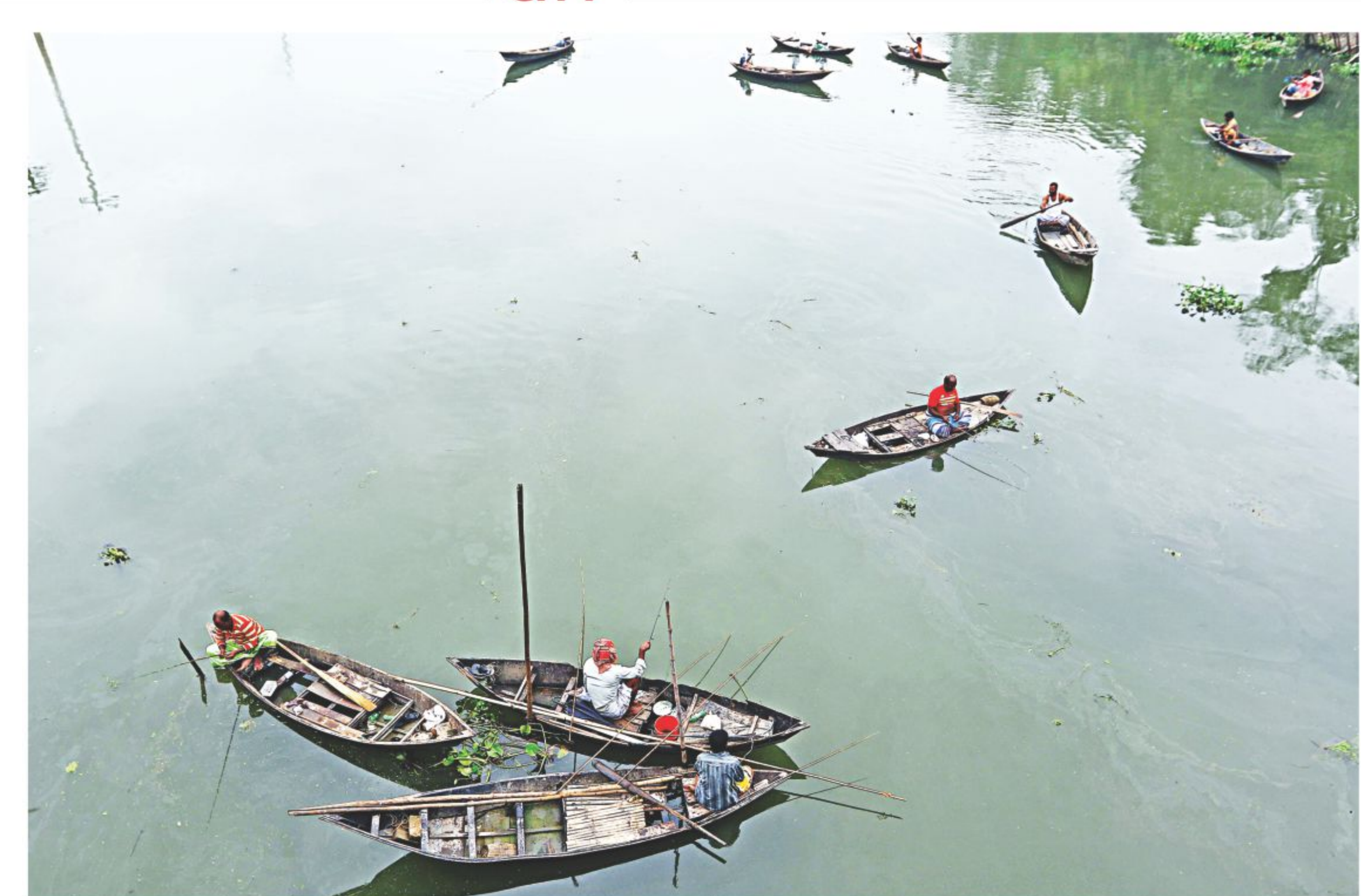
Water has been receding in the Turag river near Savar since the monsoon rain stopped a few weeks back. The shallow water in the river has been drawing quite a good number of fishermen. They were seen waiting patiently after setting their fishing rods there on Wednesday.