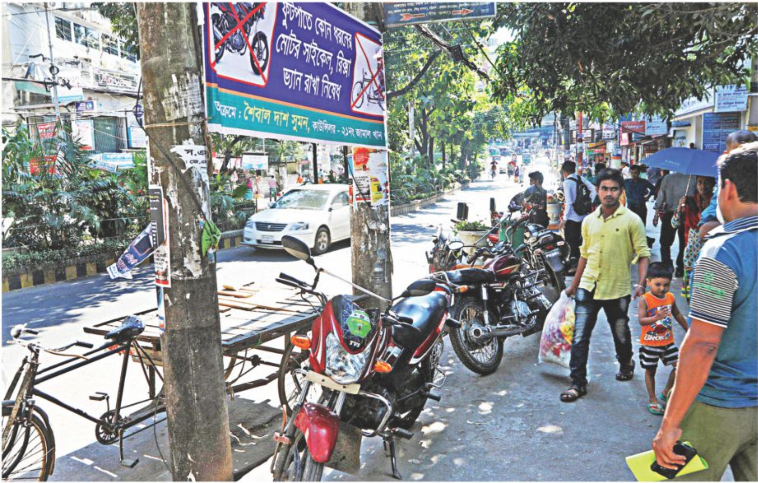
In the absence of adequate public transport more and more people these days are buying motorcycles. But with the number of the vehicle rising, rules violations are on the rise too. In this photo taken on Wednesday in Jamal Khan area of Chittagong city, motorbikes and a rickshaw van are parked right below a sign prohibiting parking of such vehicles there. Unless the authorities build awareness about respecting traffic rules among all, the situation might only get worse in future.