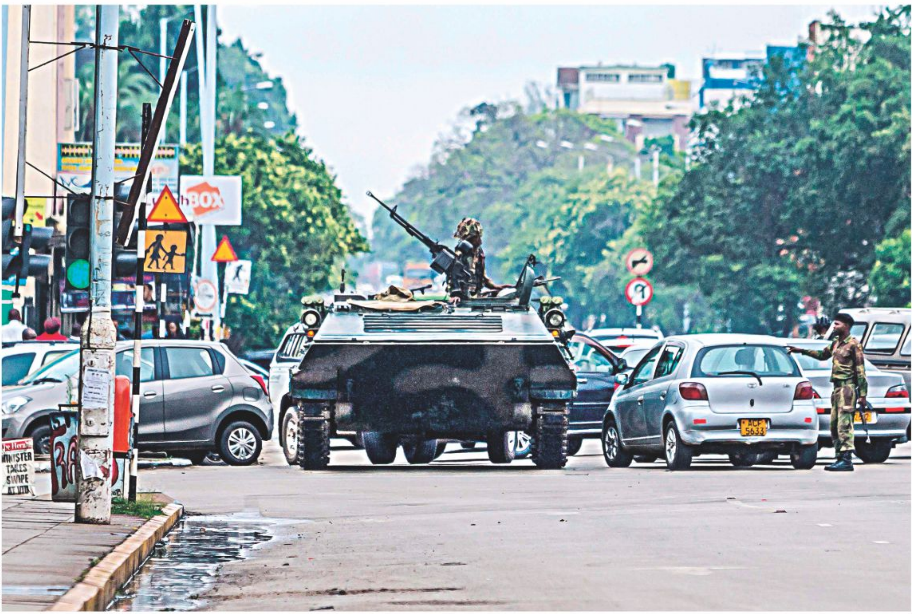
An armoured personnel carrier stations at an intersection as Zimbabwean soldiers regulate traffic in Harare yesterday. Zimbabwe's military appeared to be in control of the country as generals denied staging a coup but used state television to vow to target "criminals" close to President Mugabe.