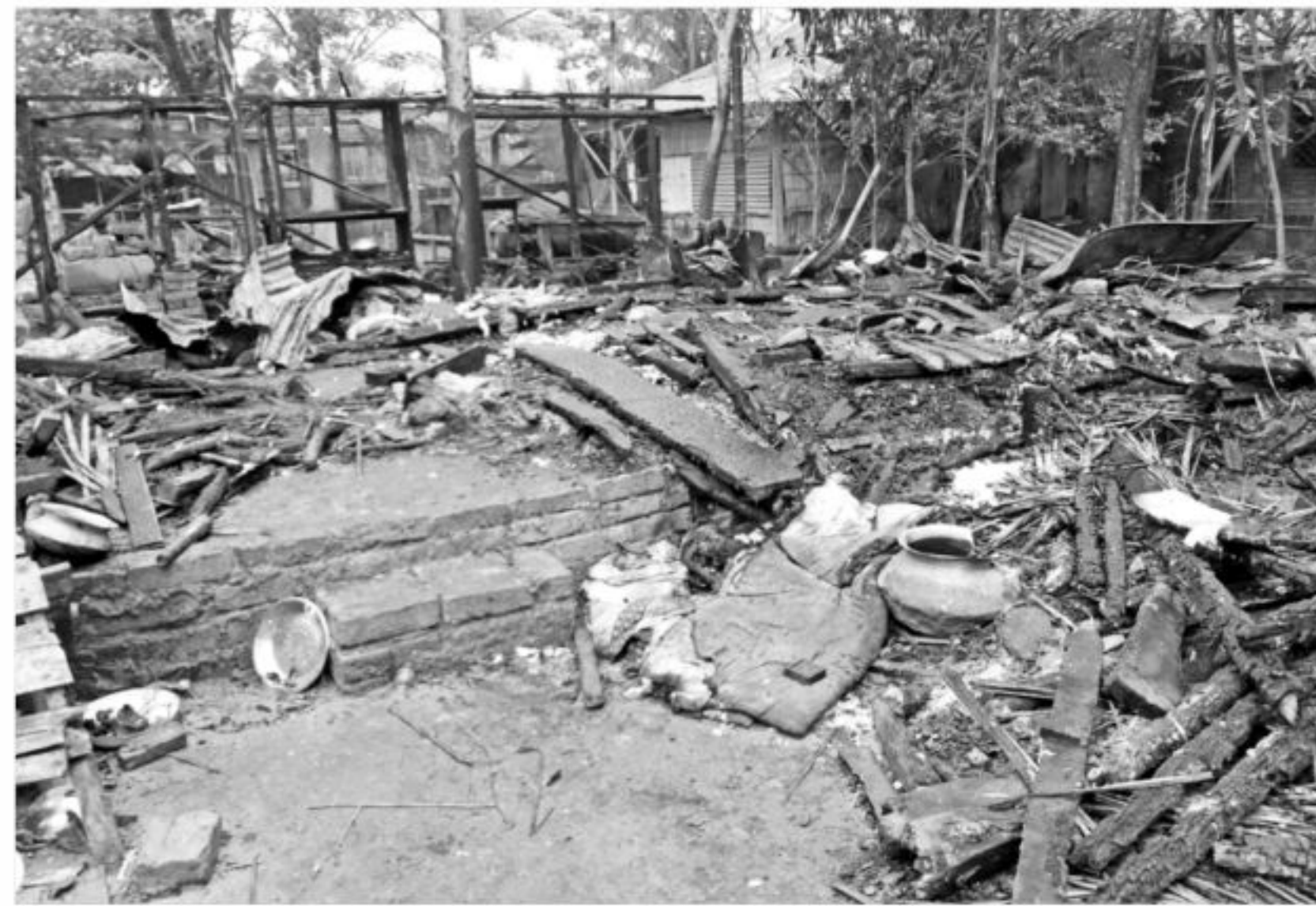
Criminals set fire to the house of a Hindu family at Arulia village in Chitalmari upazila of Bagerhat on Tuesday.