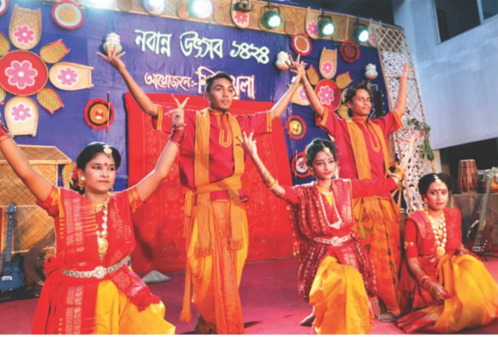
Young artistes present a group dance.

The programme continued till night with folk singer Fakir Shahabuddin as the last performer of the day.