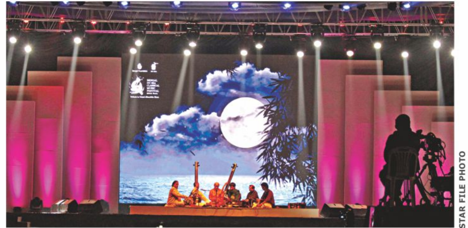
Since its 2012 inception, the festival has become Dhaka's most iconic musical event.

About the audience capacity of the festival,