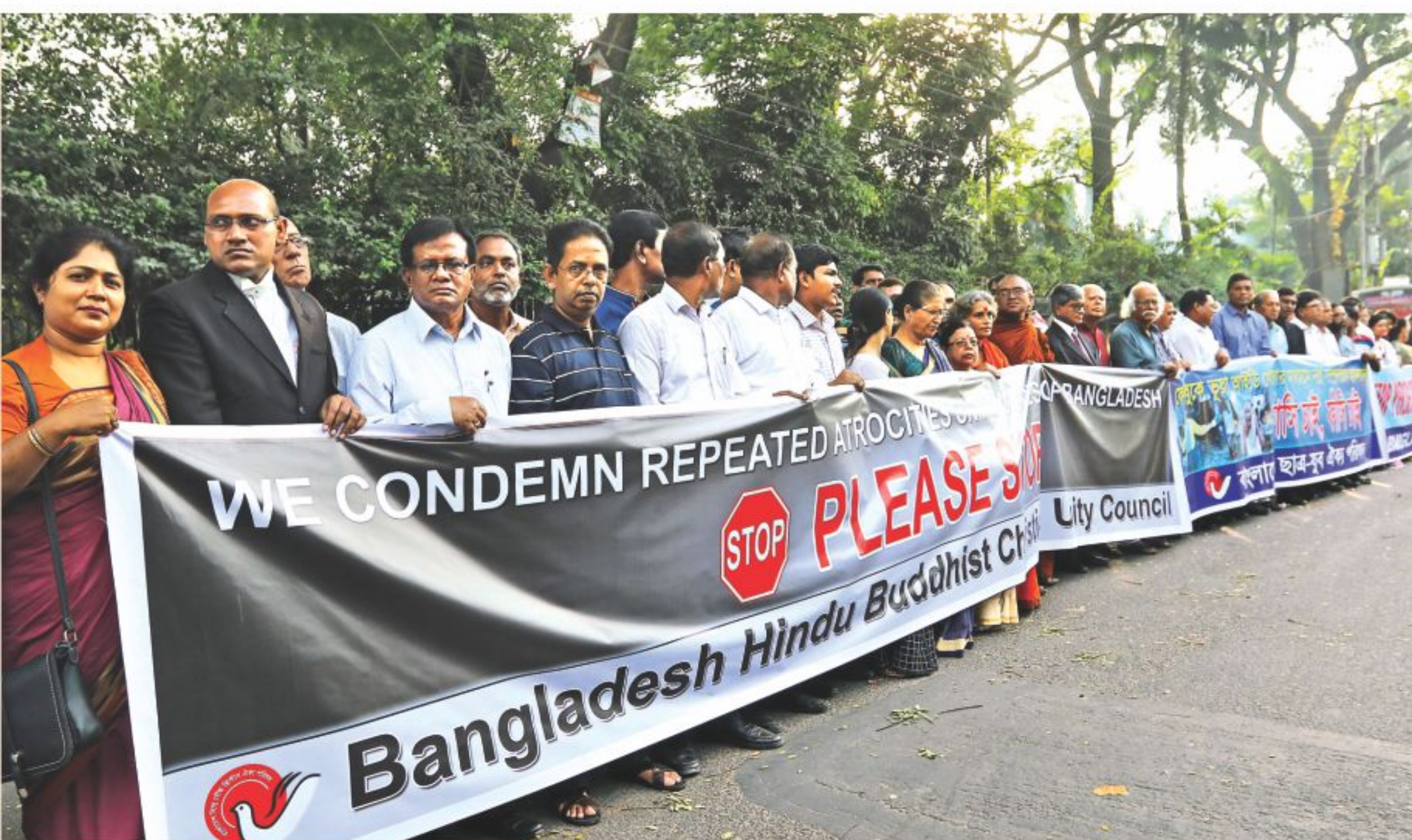
Bangladesh Hindu Buddhist Christian Unity Council forms a human chain in front of Jatiya Press Club in the capital yesterday demanding exemplary punishment for those behind the recent attacks on the Hindu community in Rangpur and Faridpur.