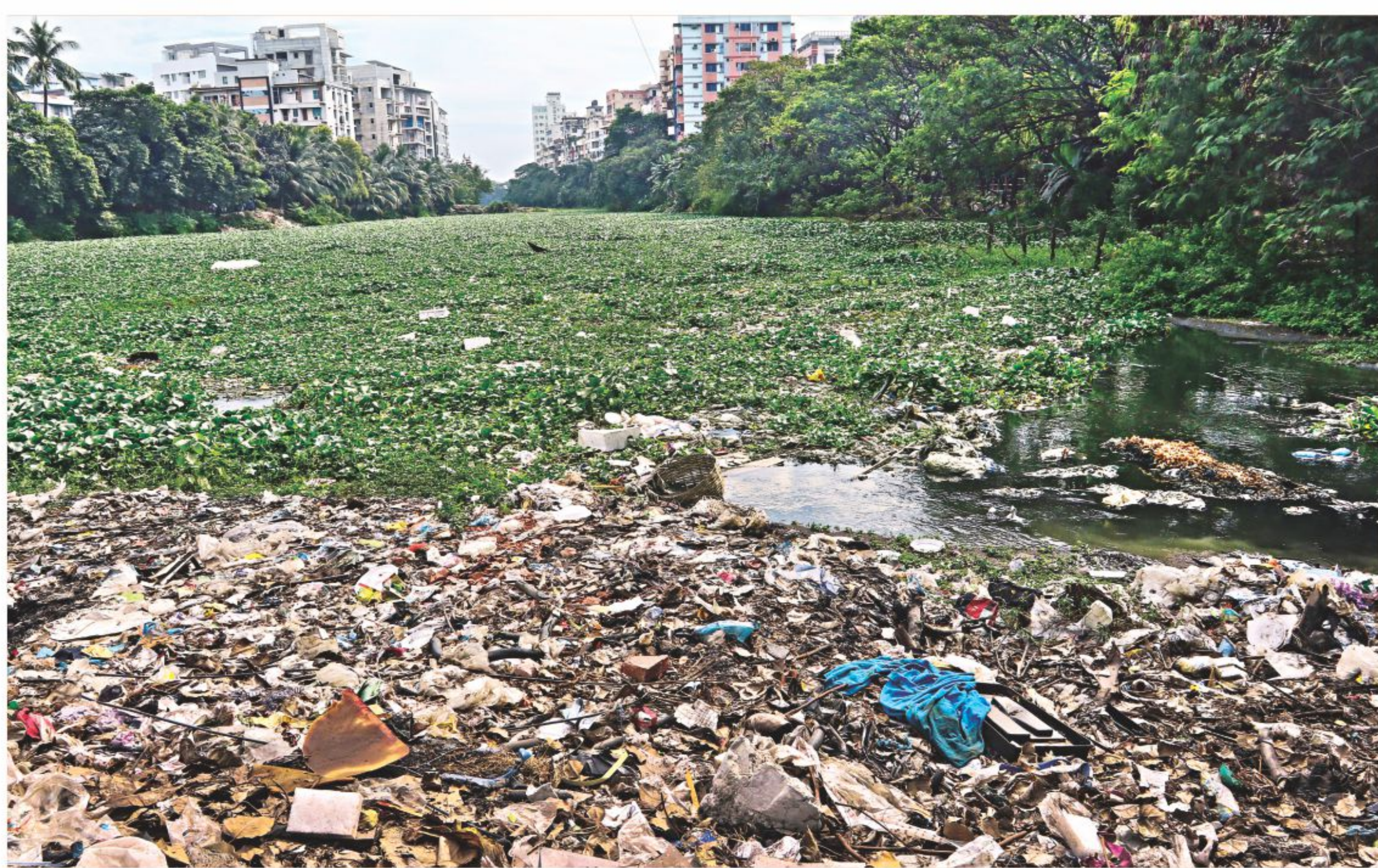
Choked with waste materials and aquatic plants, the capital's Gulshan Lake is in an awful state. Continuous dumping of garbage and sewage from adjacent residential areas keep polluting the water body. Because of the dirty and stagnant water, it has become an ideal mosquito-breeding site. The photo was taken yesterday.