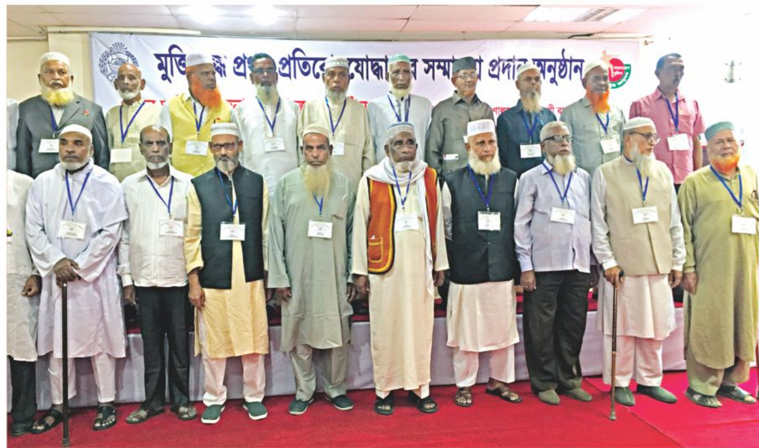
A ceremony at the capital's Police Convention Hall yesterday when the government awarded 34 former policemen in recognition of their contributions to the Liberation War. They were among other colleagues who made the first armed resistance against the Pakistan army at Rajarbagh Police Lines on the March 25 fateful night in 1971. Before this award, 44 other police personnel, who died in the incident, received recognition.