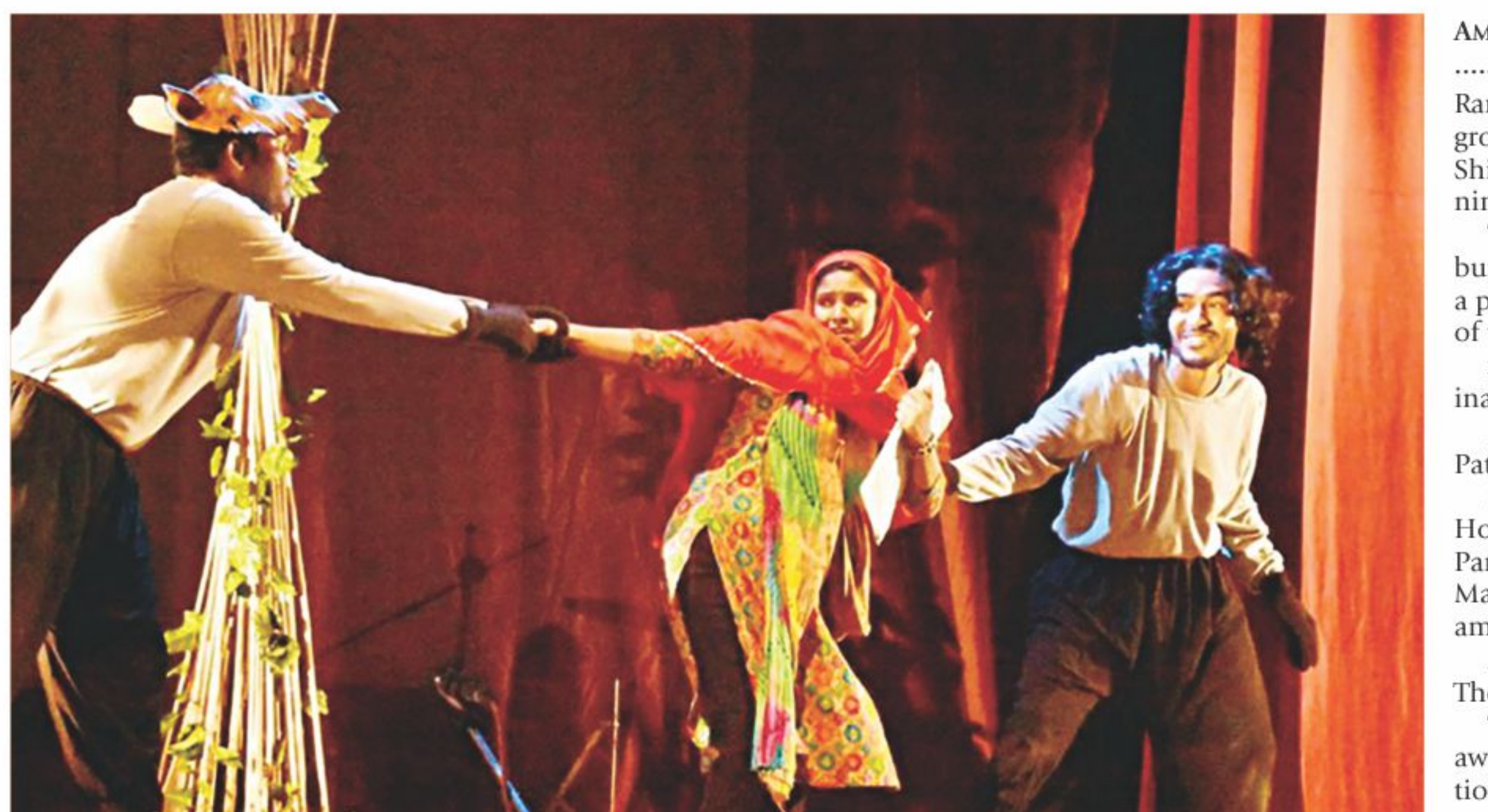
A scene from the play.