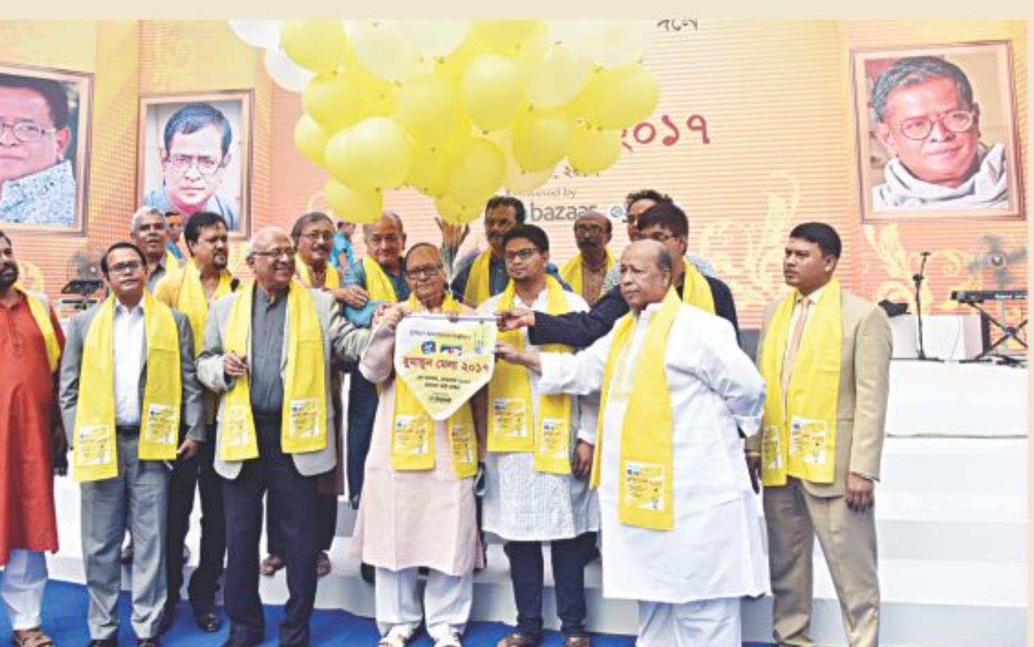
Guests set off balloons to mark the inauguration of the programme.

"Humayun Mela" is organised by Channel i, and sponsored by ACI Pure Salt.