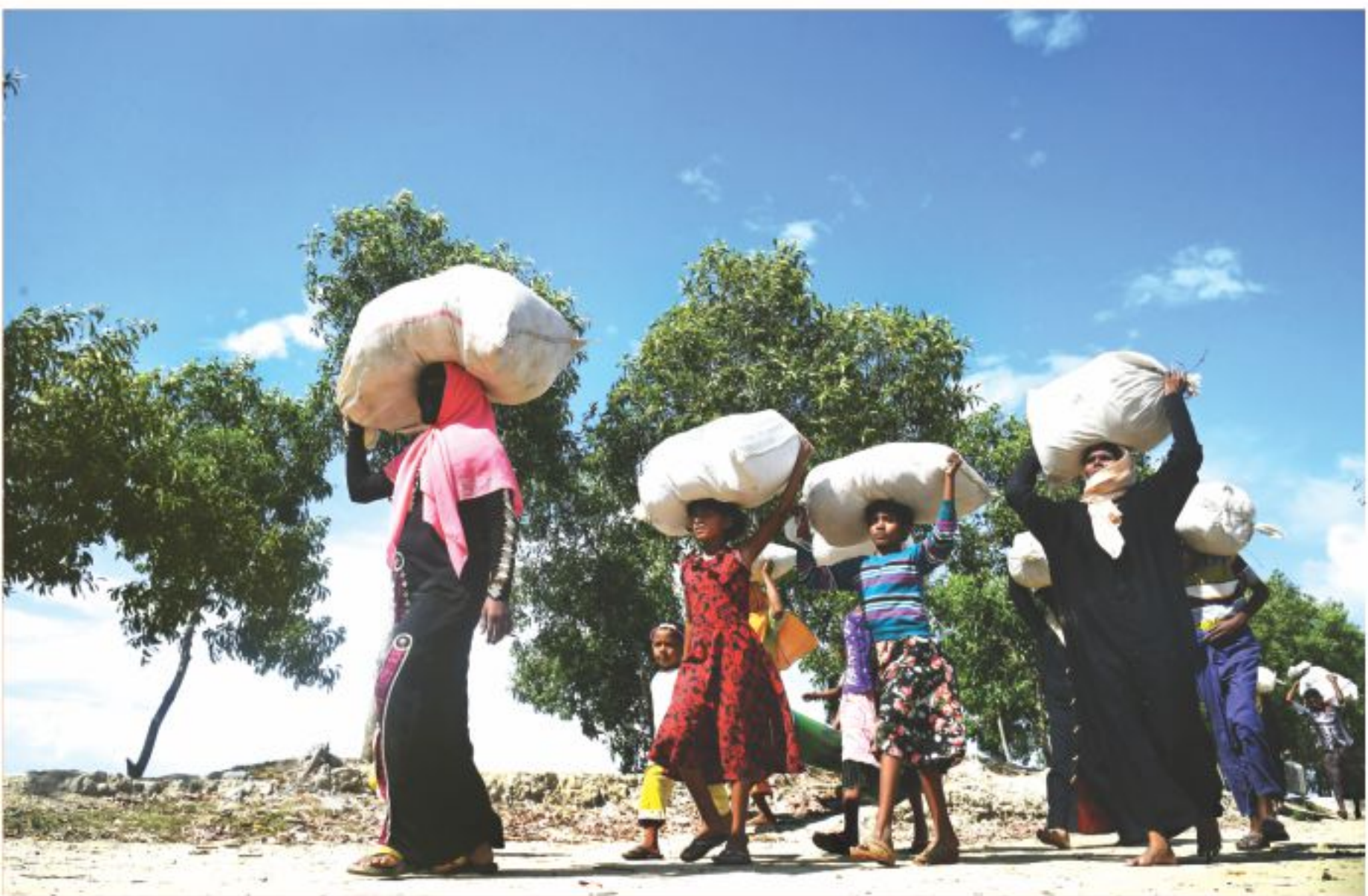
Rohingya refugees who entered Bangladesh on makeshift boats walk towards refugee camps after landing in Sabrang of Teknaf yesterday.