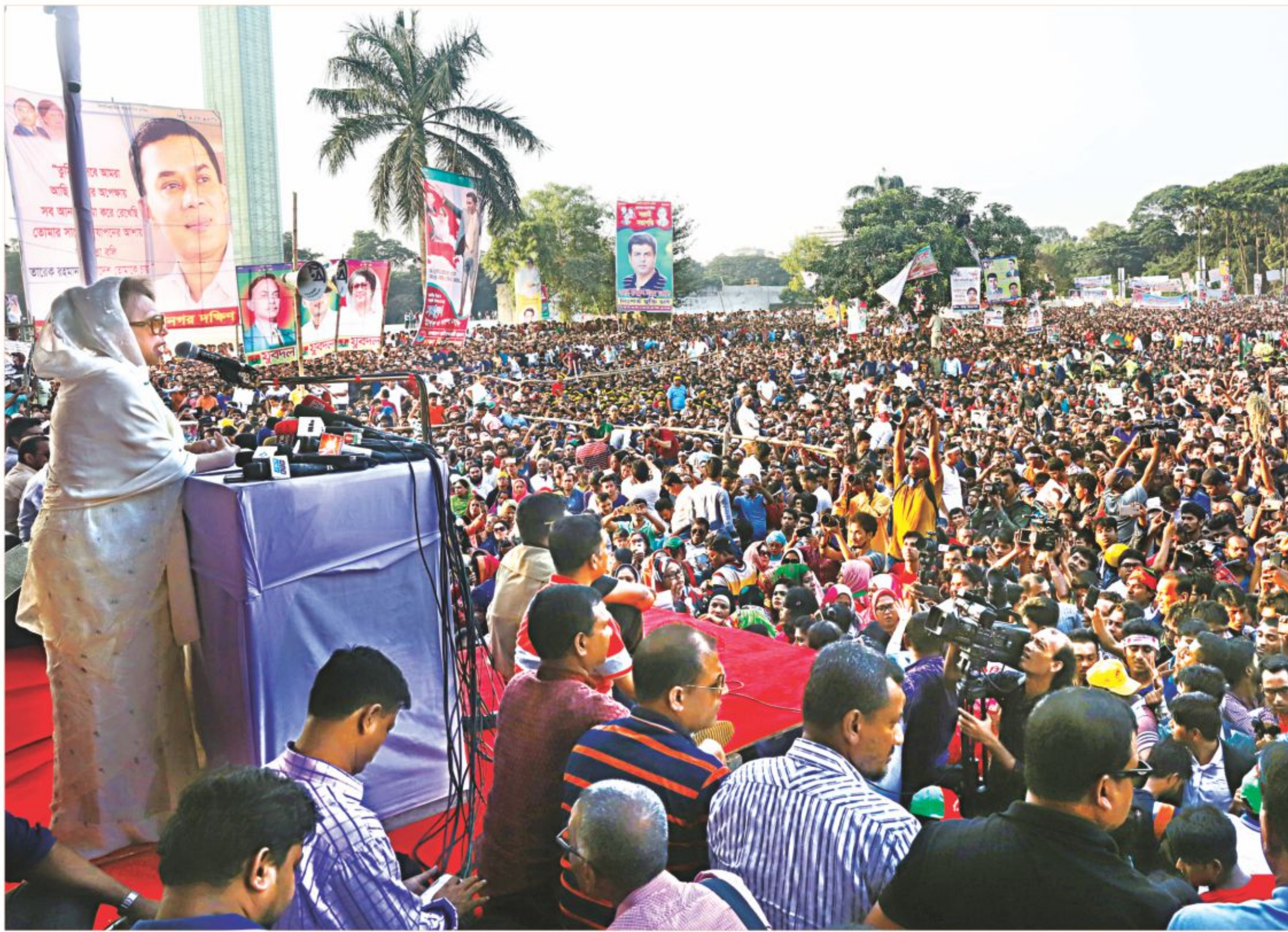
BNP Chairperson Khaleda Zia addressing a huge rally in Suhrawardy Udyan in the capital yesterday afternoon. This was her first rally in the city in 18 months.