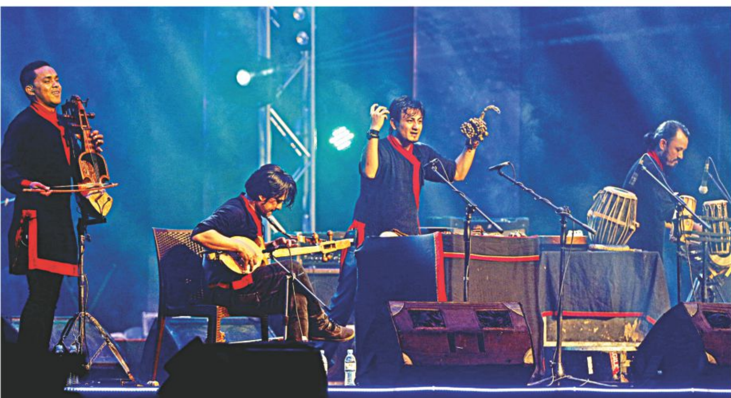
Nepalese instrumental folk band Kutumba performs on the second day of the Dhaka International Folk Festival in the capital's Army Stadium yesterday.