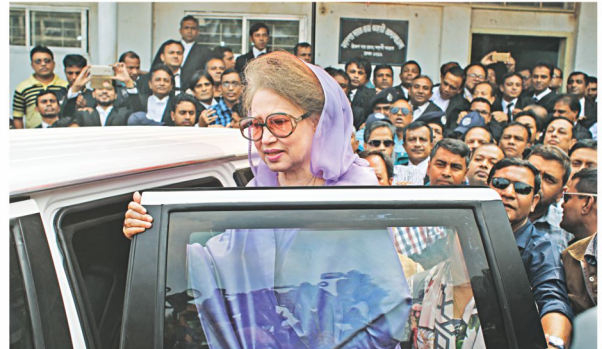
BNP Chairperson Khaleda Zia at Bakshibazar makeshift court premises in the capital yesterday after she appeared before it in Zia Orphanage Trust corruption case.

The lawyer also said the HC delivered the verdict on the grounds that every citizen has right to free movement all over the world.