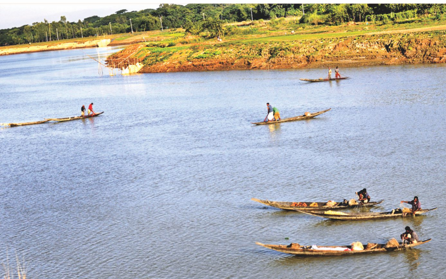
Fishermen busy fishing in the soft rays of the morning sun in Chenger Khal River in Sylhet yesterday. They are in a festive mood as the receding water has increased the availability of fish.