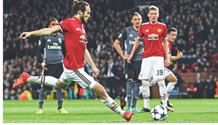
After a three-way tussle for a penalty which saw Ander Herrera rebuff Romelu Lukaku before being moved away by Daley Blind, who vindicated manager Jose Mourinho's decision by slotting home from the spot against Benfica on Tuesday.

Blind settled matters in the 78th minute by drilling the penalty down the middle.