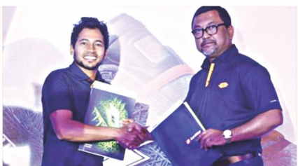
Bangladesh Test captain Mushfiqur Rahim signed an agreement with Lotto to become its brand ambassador recently.

Holders Titas Club registered their second victory in the Premier Division Volleyball League when they handed a straight sets (3-0) defeat to Dhaka Sabuj Club at the Paltan Volleyball Stadium yesterday. Titas Club won the match 25-10, 25-10, 25-11 before Bangladesh Police registered a 25-18, 25-18, 25-18 victory over Fire Service and Civil Defence in the day's second match.