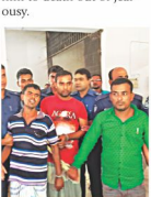
Three convicted convicts at the court.

On October 7, 2002, the trio forced Alamgir out of Sirajul's house and stabbed him to death out of jealousy.