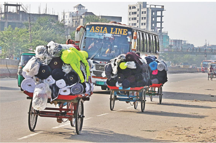
Rickshaw-vans loaded with goods plying the wrong side of the busy Dhaka-Chittagang highway. Slow-moving and non-motorised vehicles take to the national highway with hardly any obstruction from law enforcers. As a result, fatal accidents often take place on the roads. The photo was taken from Signboard area in Narayanganj on Tuesday.