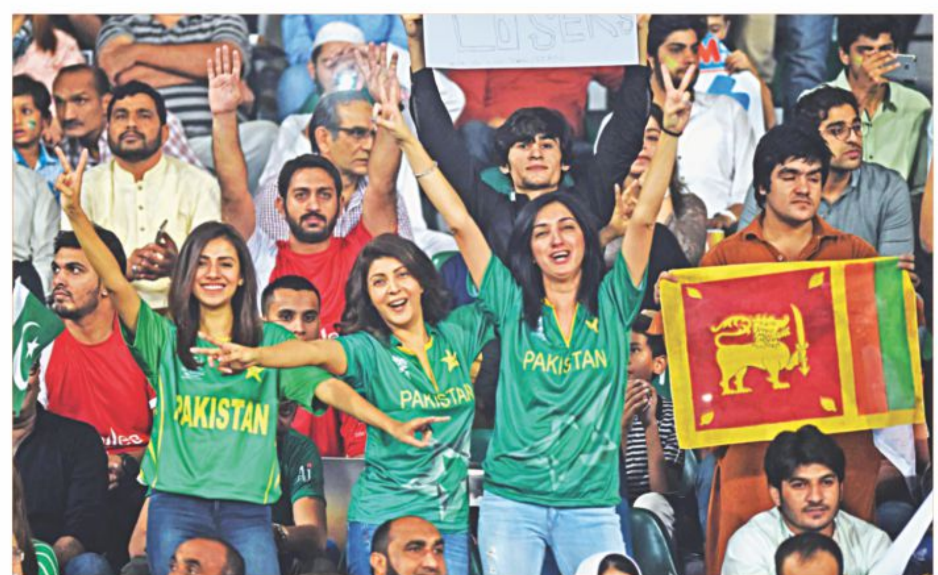
Pakistan fans enjoy the first international match against a top touring side, after eight long years in hibernation, at the Gaddafi Stadium in Lahore yesterday.