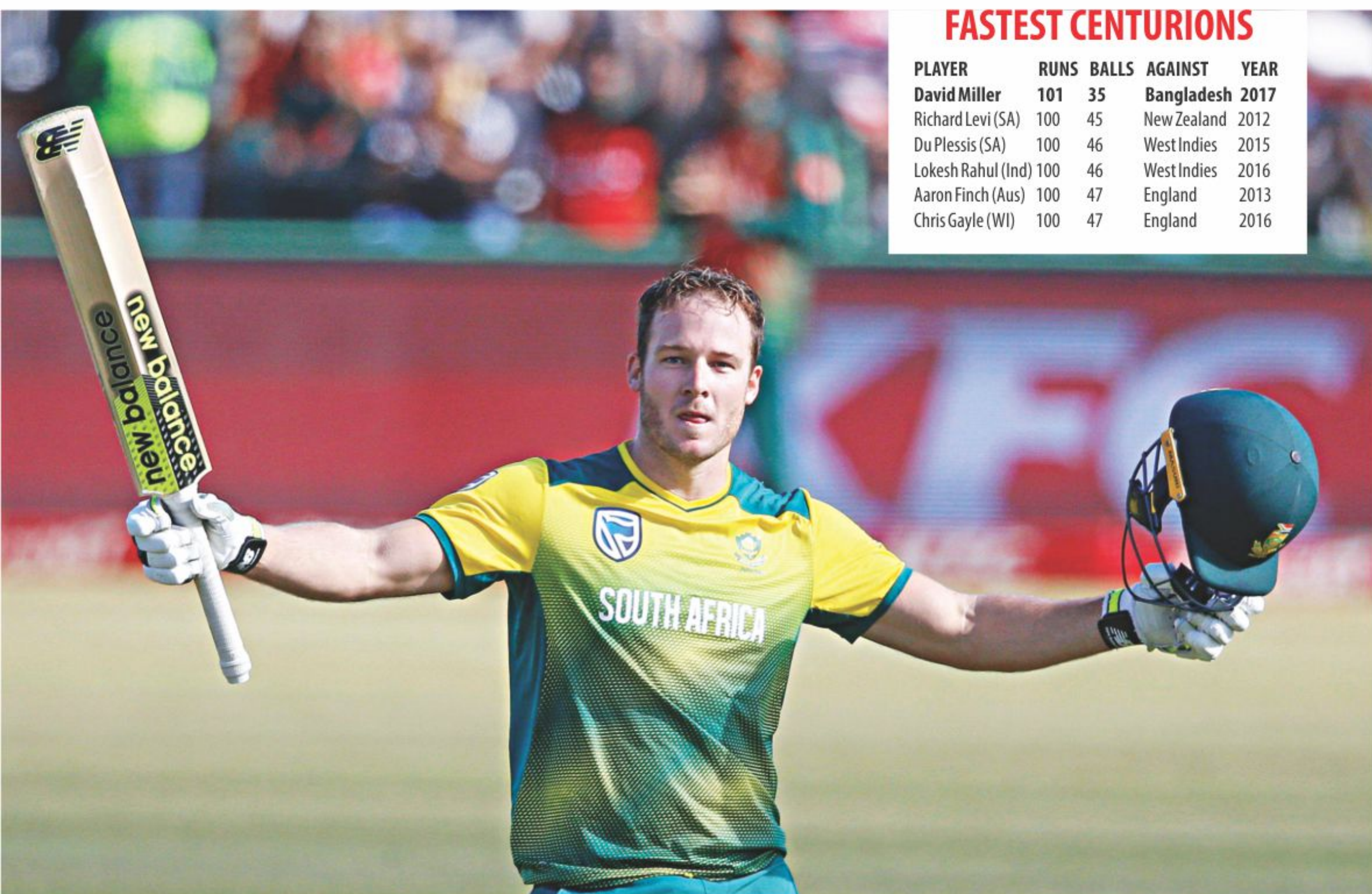
MAGNIFICENT MILLER: South Africa batsman David Miller smashed the hapless Bangladesh bowlers all over the park on way to a mindboggling 35-ball 100 – the quickest in the shortest format of the game – during the second and final T20I at the Senwes Park in Potchefstroom yesterday.