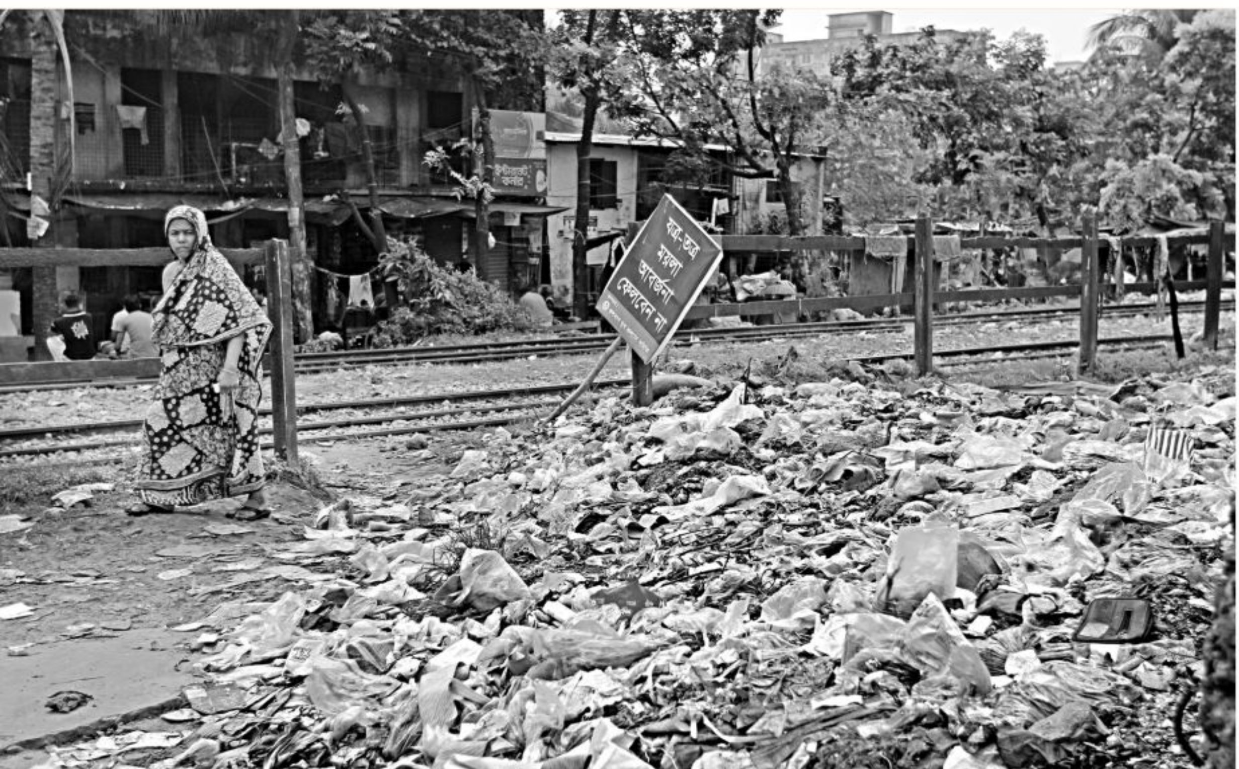
Putting up a sign does not necessarily create awareness. The litter-strewn place beside rail tracks at Shantibagh in the capital is a glaring example of such statement. Even though a local organisation posted a sign there requesting not to litter, nobody seems to care. The photo was taken yesterday.