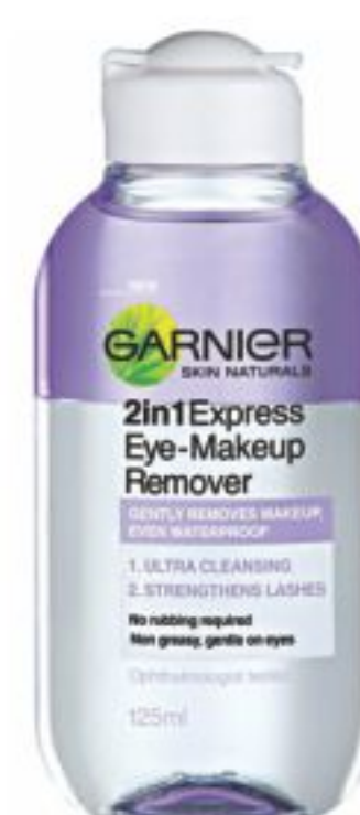
Garnier Eye Makeup Remover