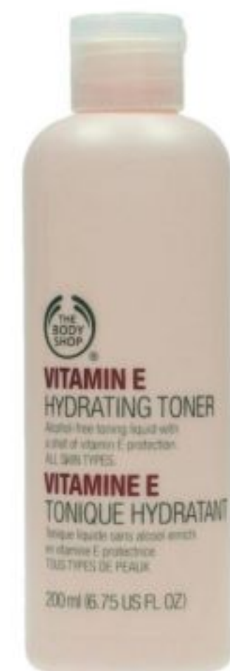
Body Shop Vitamin E Hydrating Toner