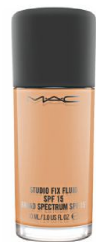
MAC Studio Fix Fluid Foundation