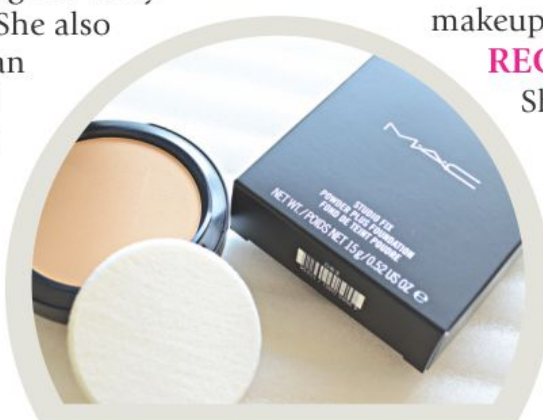
Mac Studio Fix Powder Plus Foundation