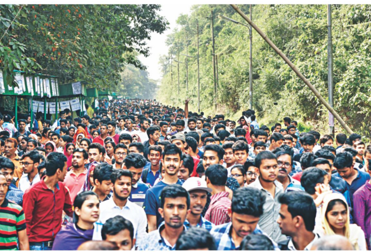
GOOD LUCK! Aspirants throng the Chittagong University campus as the honours admission tests for the 2017-2018 academic session started yesterday. A total of 1,26,057 candidates are vying for 4,924 seats. The tests will continue till Sunday.