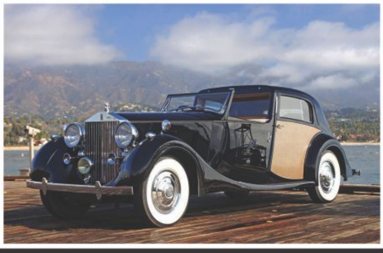
1938 PHANTOM III

The II was built around an improved 40/50 inline 6 engine and was offered in a Continental model with short wheelbase.