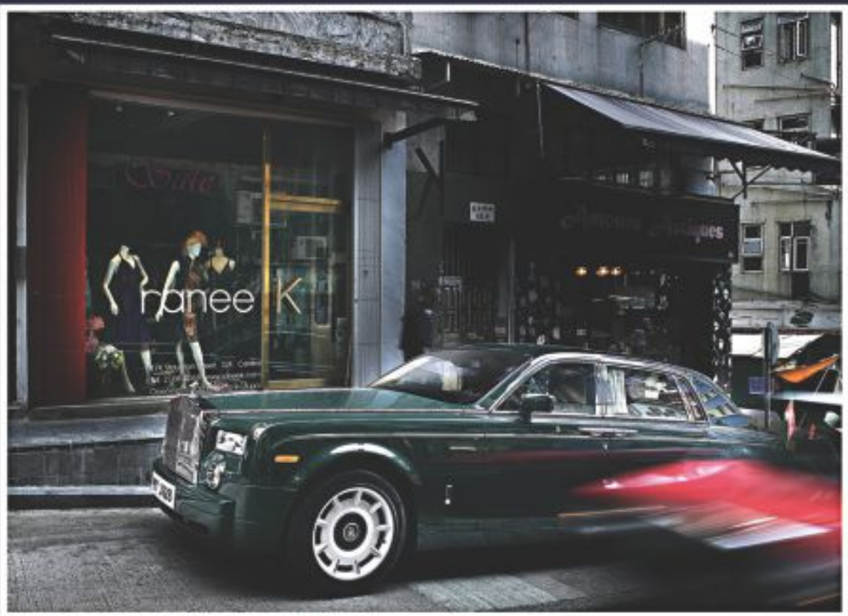
2003 PHANTOM VII

Under new ownership as part of VW Group, the Phantom name was killed off and replaced by the Silver Shadow and Seraph. Sold to BMW Group in 1998, the Rolls Royce brand entered a new era with the all-new Phantom launched in 2003. Featuring a significant bump in technology, safety and new-age luxury, the Phantom embodied wealth and celebrity culture. With more rivals than ever and born into a consumerist world, the Phantom certainly needed to evolve to survive. With the evolution of the brand, the typical owner of RR vehicles also changed - still somewhat exclusive, the Phantom was sold to musicians, business owners and movie stars. You didn't need to be a head of state to own a Phantom anymore.