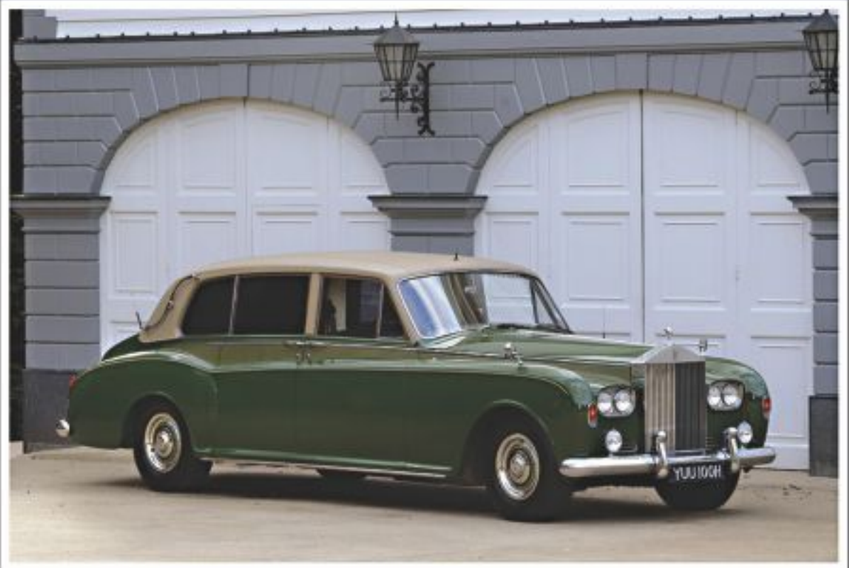
1968 PHANTOM VI

Standard bodies built by HJ Mulliner, Park Ward and James Young meant there were less variations of the Phantom than before.