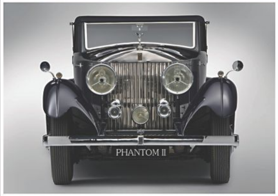
1935 PHANTOM II

The 40/50 came with a 7.7 litre inline six engine, with RR providing only the mechanical components.