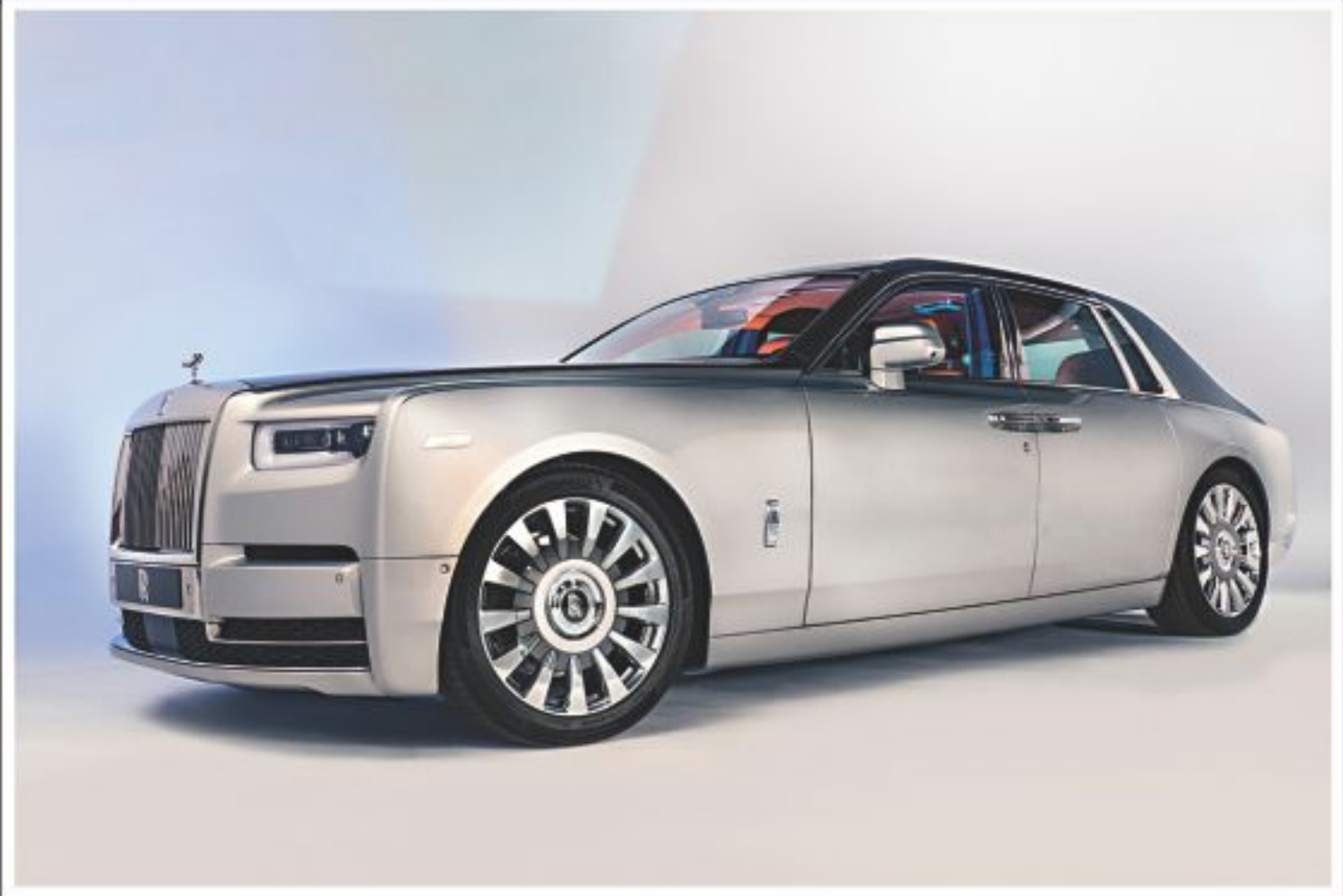
2018 PHANTOM VIII

The first revamped RR model for nearly a decade, the Phantom redefined luxury motoring for the 2000s.