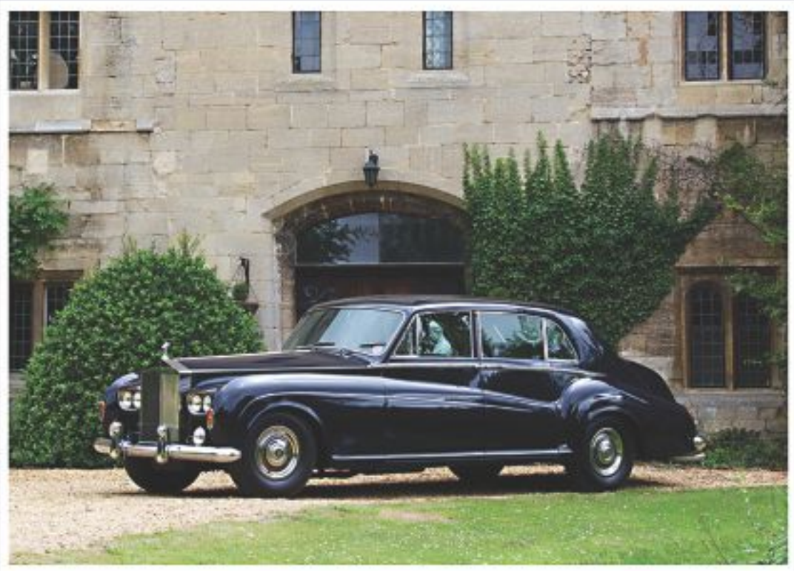
1959 PHANTOM V

Only 18 Phantom IVs were built, mostly for heads of state and other dignitaries. 16 are currently housed in museums, making the IV the most exclusive factory Rolls Royce ever made.