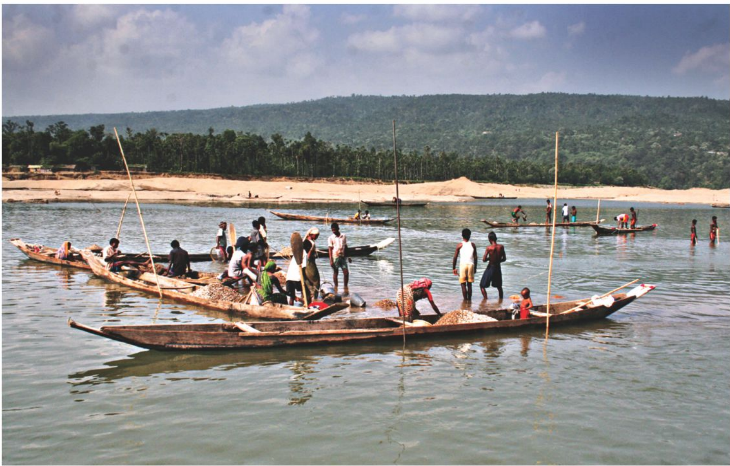
Jaflong, a tourist spot in Sylhet, continues to suffer ecological damage as illegal stone extraction goes on unabated in the Piyain River. Jaflong has been declared an ecologically critical area, and any economic activities that might affect the environment are restricted there. The photo was taken on Saturday.