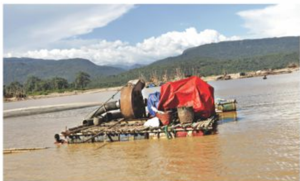
MINTU DESHWARA, back from Jaflong

100 illegal excavators lifting stones endanger the environment of the ecologically critical area