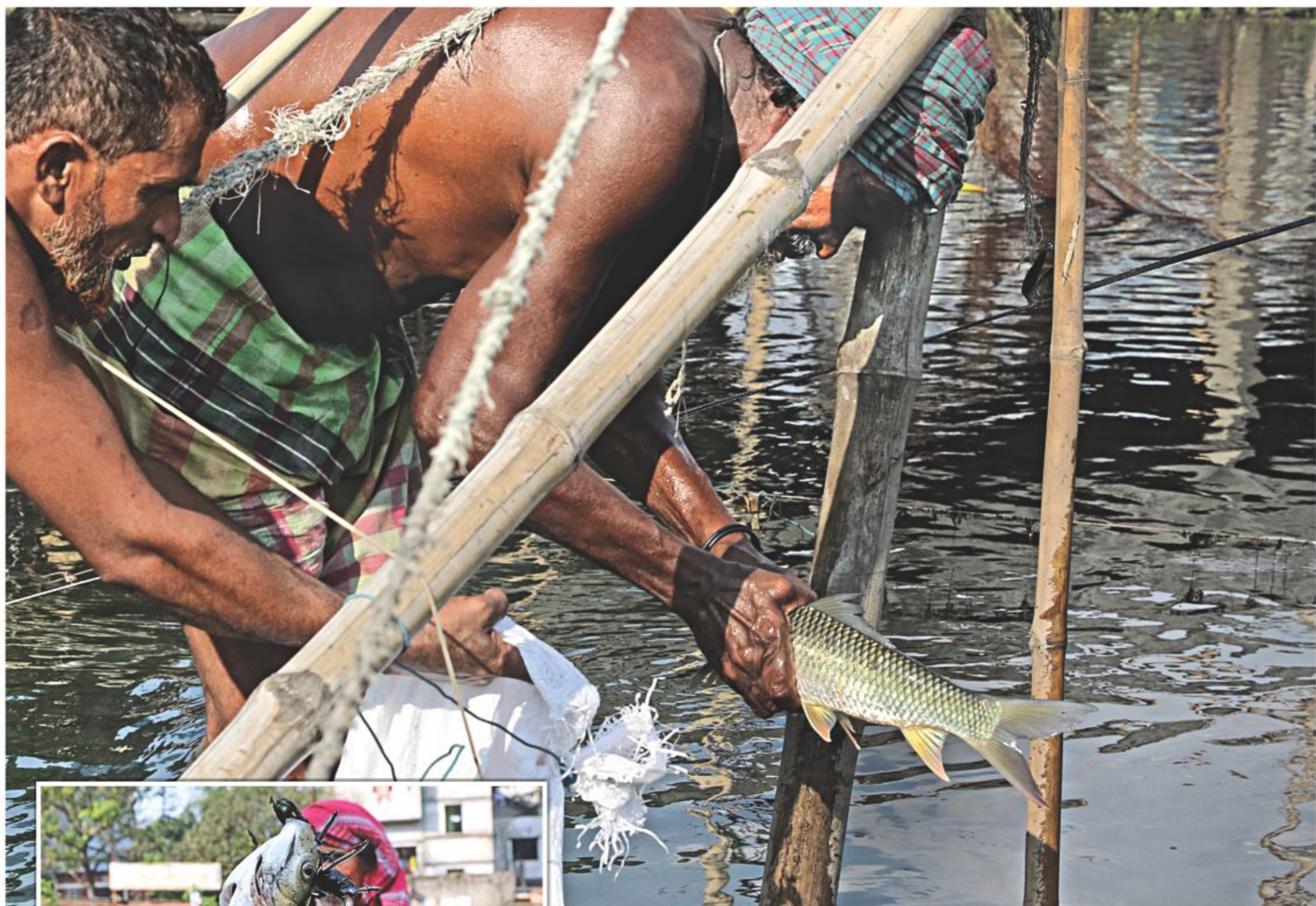
People catching fish in a canal in Signboard area of Narayanganj yesterday. Heavy rains of late have caused nearby fish farms to overflow into the local canals, releasing the fish.