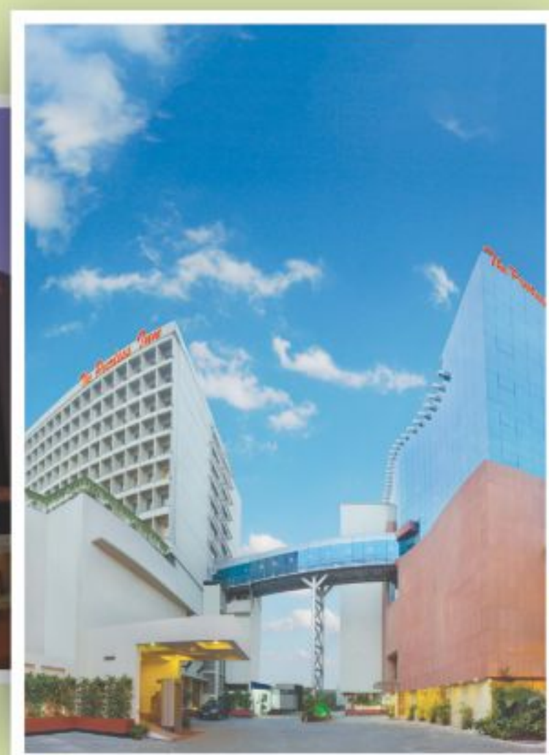
The Peerless Inn, Kolkata