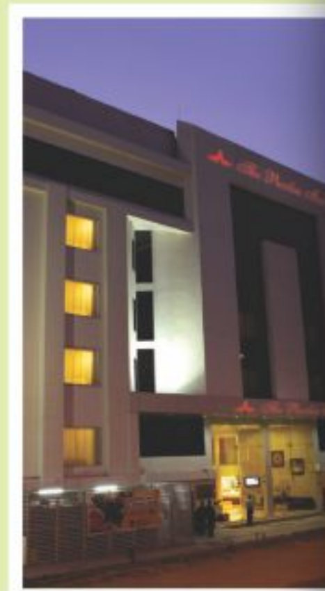
The Peerless Inn, Hyderabad