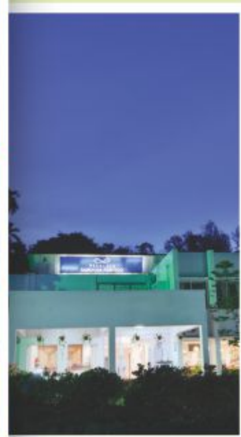
Peerless Sarovar Portico, Port Blair

Peerless Hotels Ltd. caters to business travellers and tourists from across the world. Its flagship properties are The Peerless Inn, Kolkata, The Peerless Inn, Hyderabad and Peerless Sarovar Portico, Port Blair.