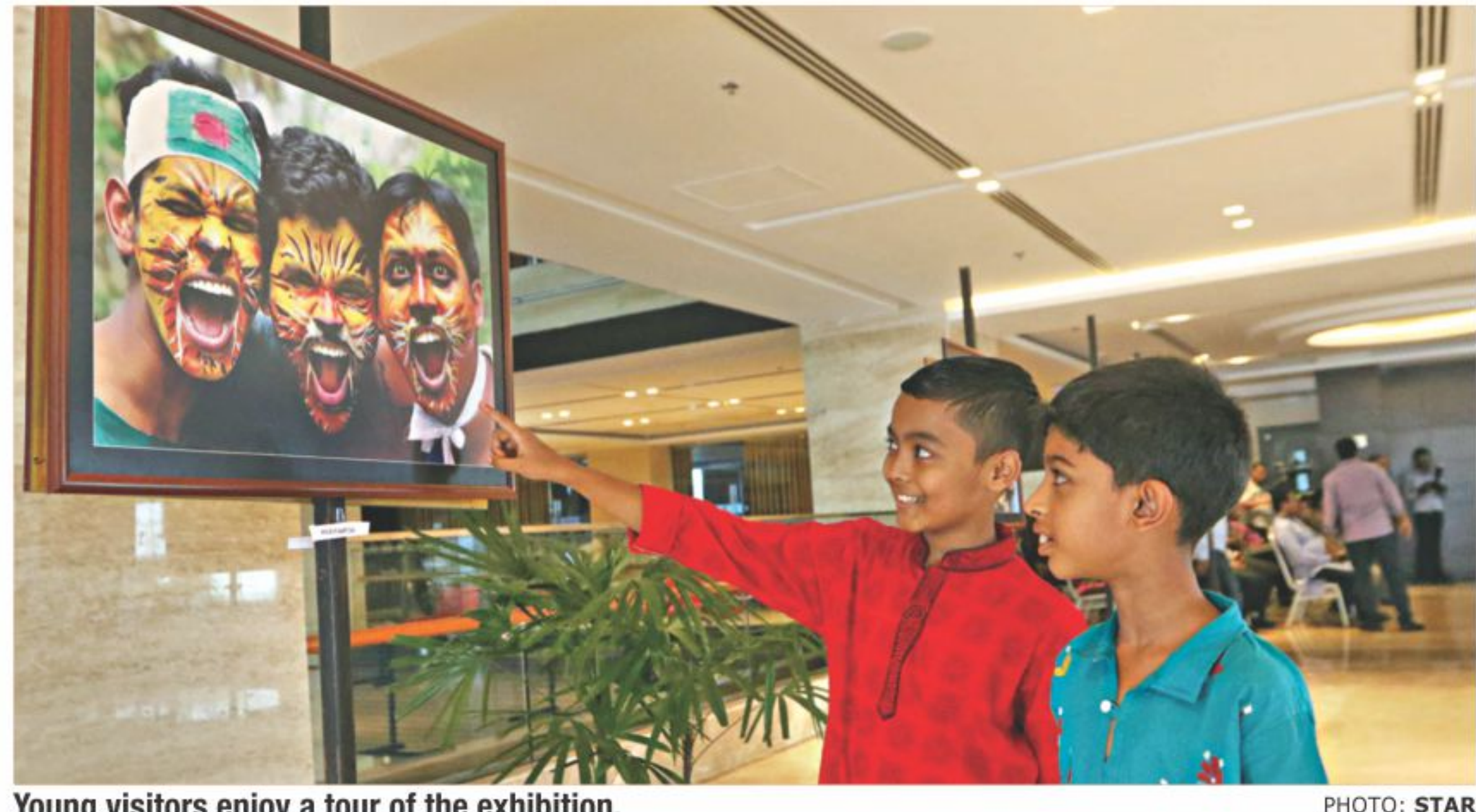
Young visitors enjoy a tour of the exhibition.