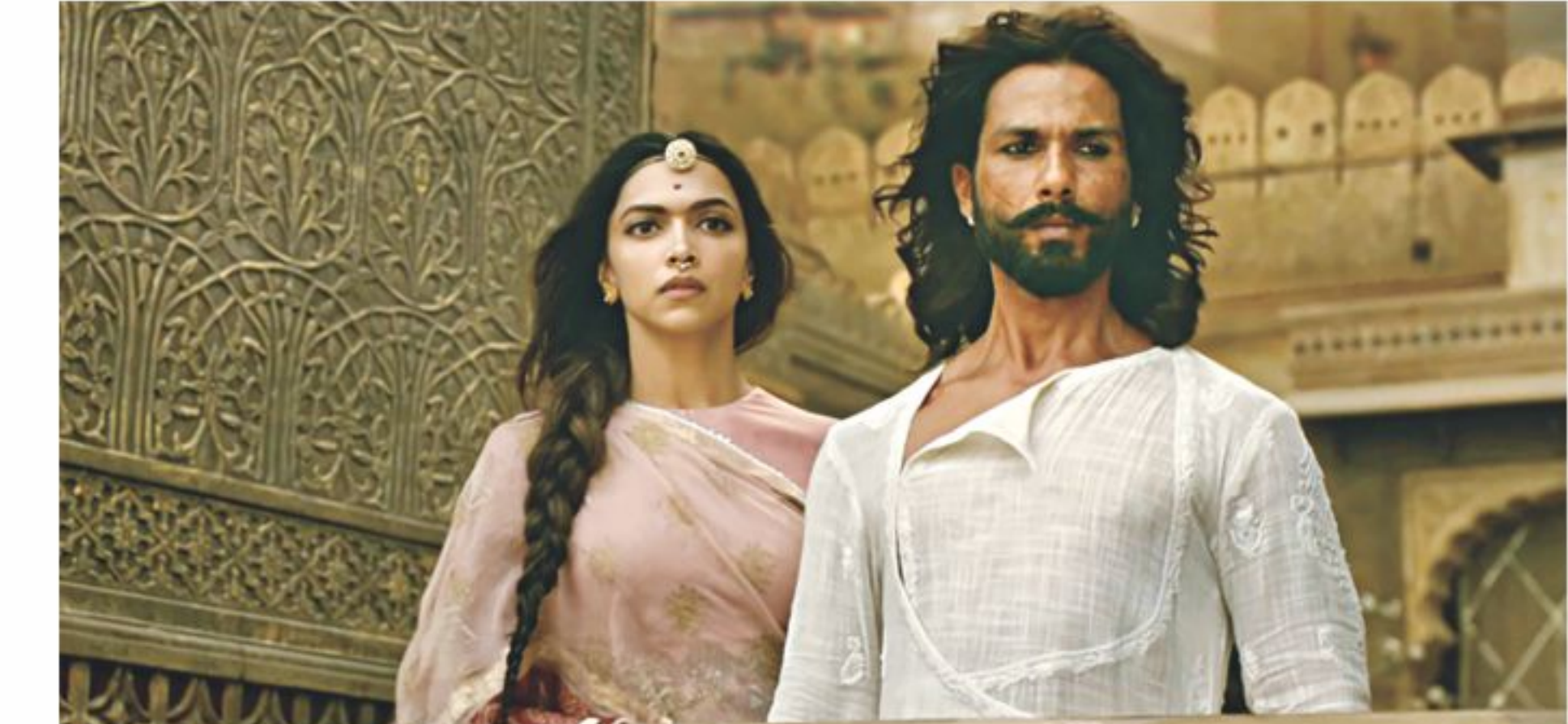
Deepika and Shahid Kapoor in a still from the trailer.

Keeping their promise to fans, stars of Sanjay Leela Bhansali's "Padmavati" -- Deepika Padukone, Shahid Kapoor and Ranveer Singh -- unveiled the first trailer of their period saga on Monday. The trailer launched exactly at 13:03, signifying the year 1303 when the eight-month long siege of Chittor by Sultan Alauddin Khilji took place. Ranveer plays Alauddin Khilji and Shahid essays the role of Maharawal Ratan Singh in the much-awaited film. Deepika plays the titular role of Padmavati. The film also stars Raza Murad and Aditi Rao Hydari.