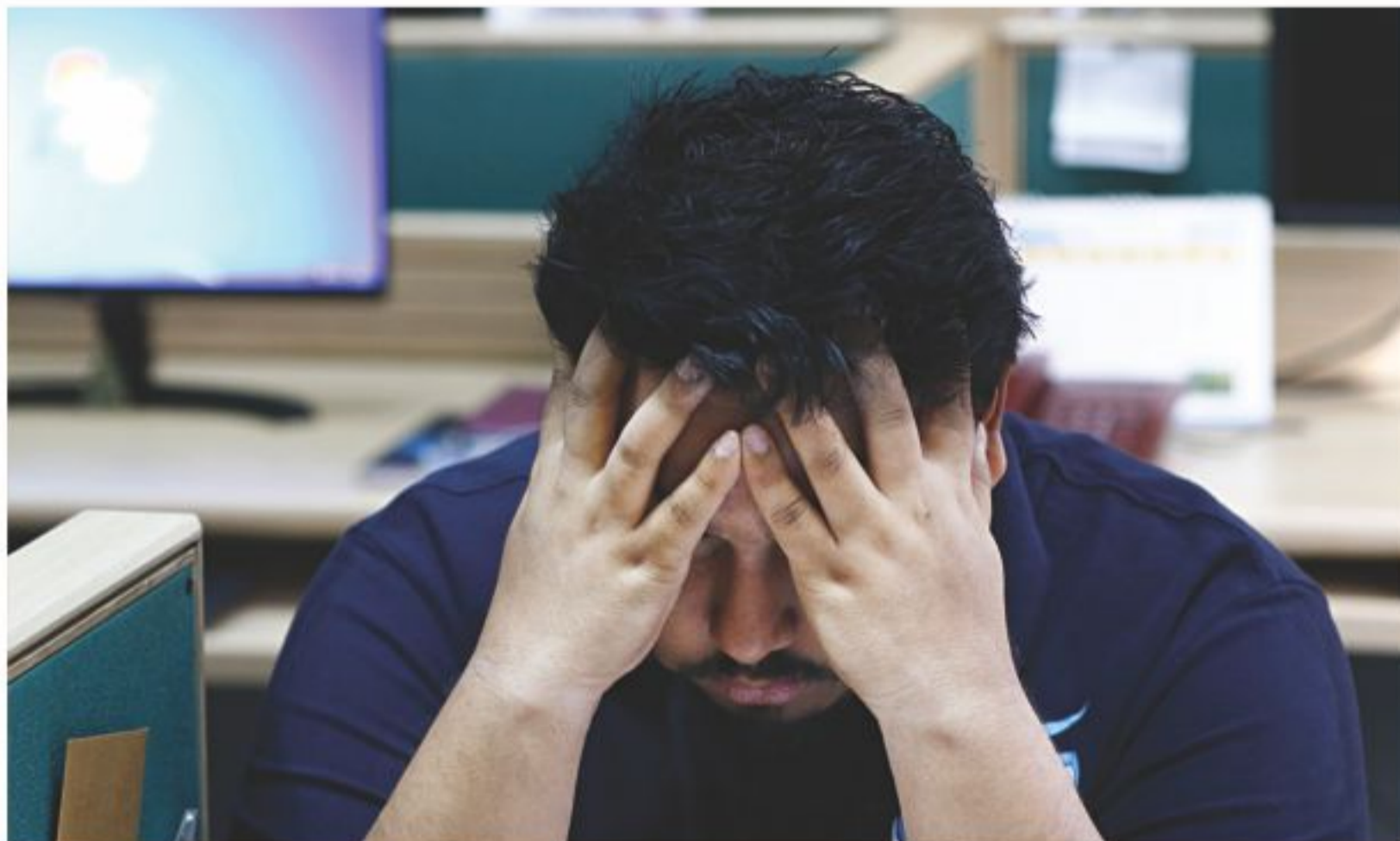
In Bangladesh, mental health in the workplace is yet to get the attention it deserves.