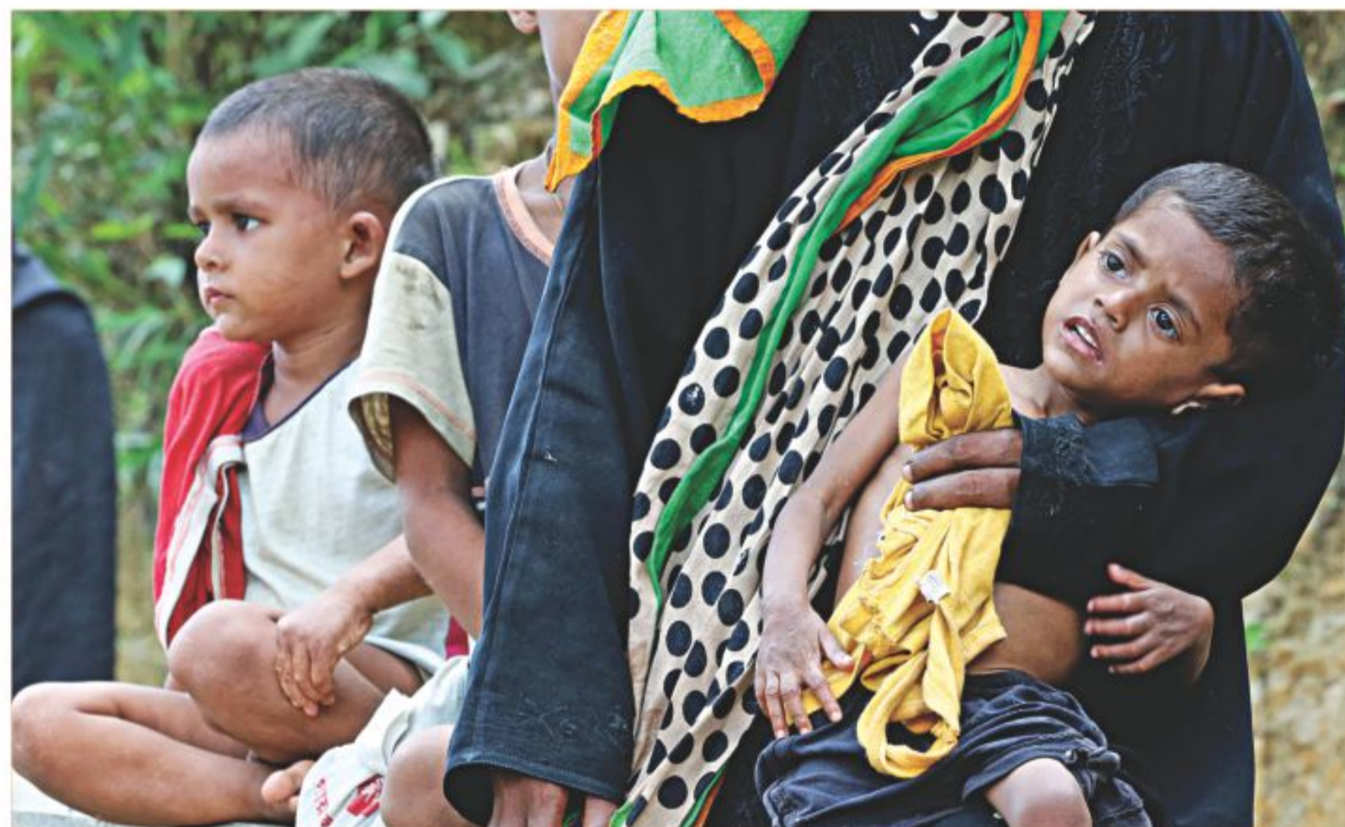
Thousands of Rohingya children and adolescents are in need of counselling to cope with the trauma.

his mother's lap. The parents were not asking anyone for help, just staring blankly at everyone passing them. They had been in the same place for two days, with no money to pay for transit to a camp. I touched the baby and felt burning temperature and unusual breathing which clearly indicates pneumonia. I took them back to Teknaf with me. On arrival,