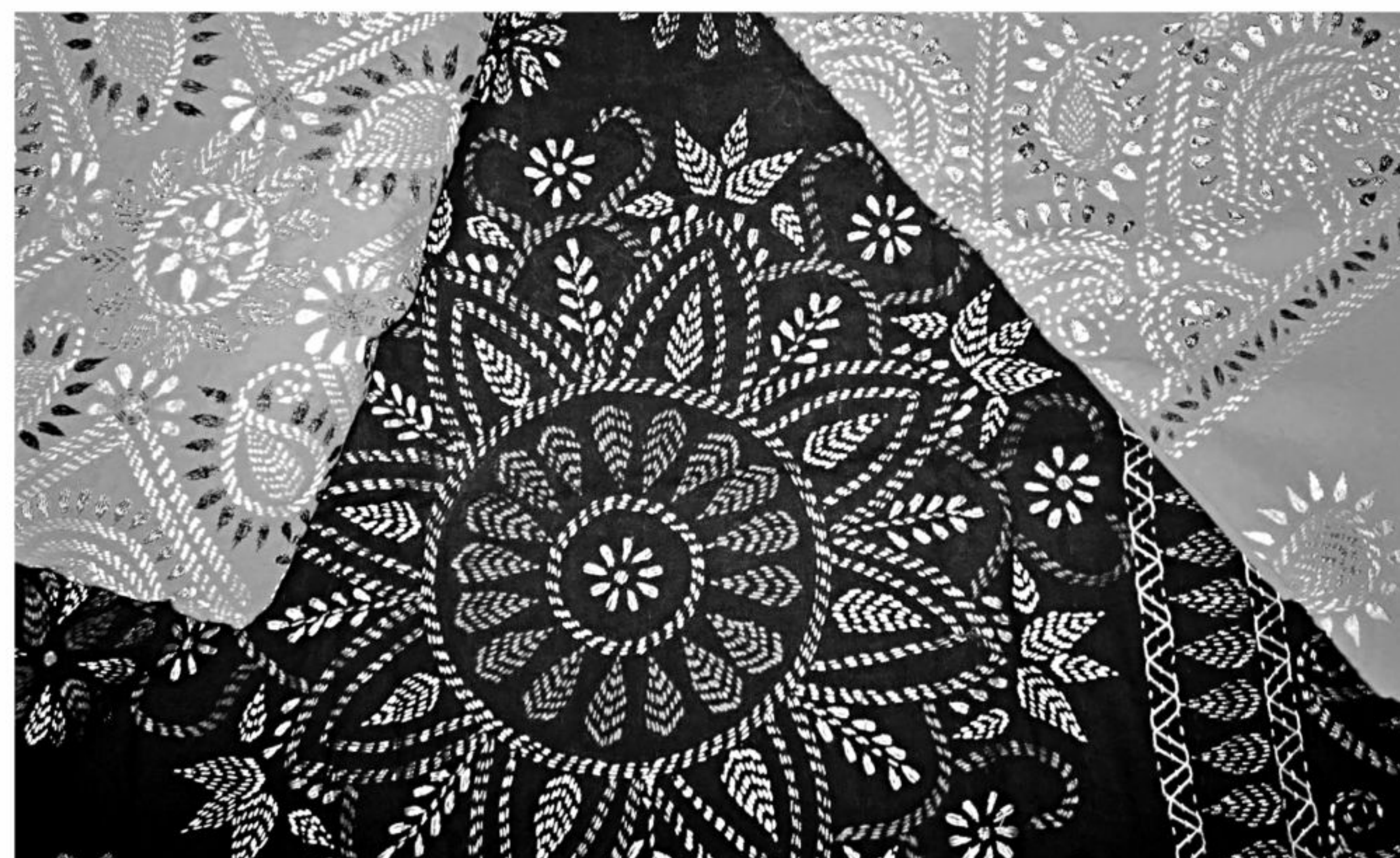
India already has the Geographical Indication for Fazli mangoes and has filed the same for nakshi kantha , a centuries-old heritage of ours.