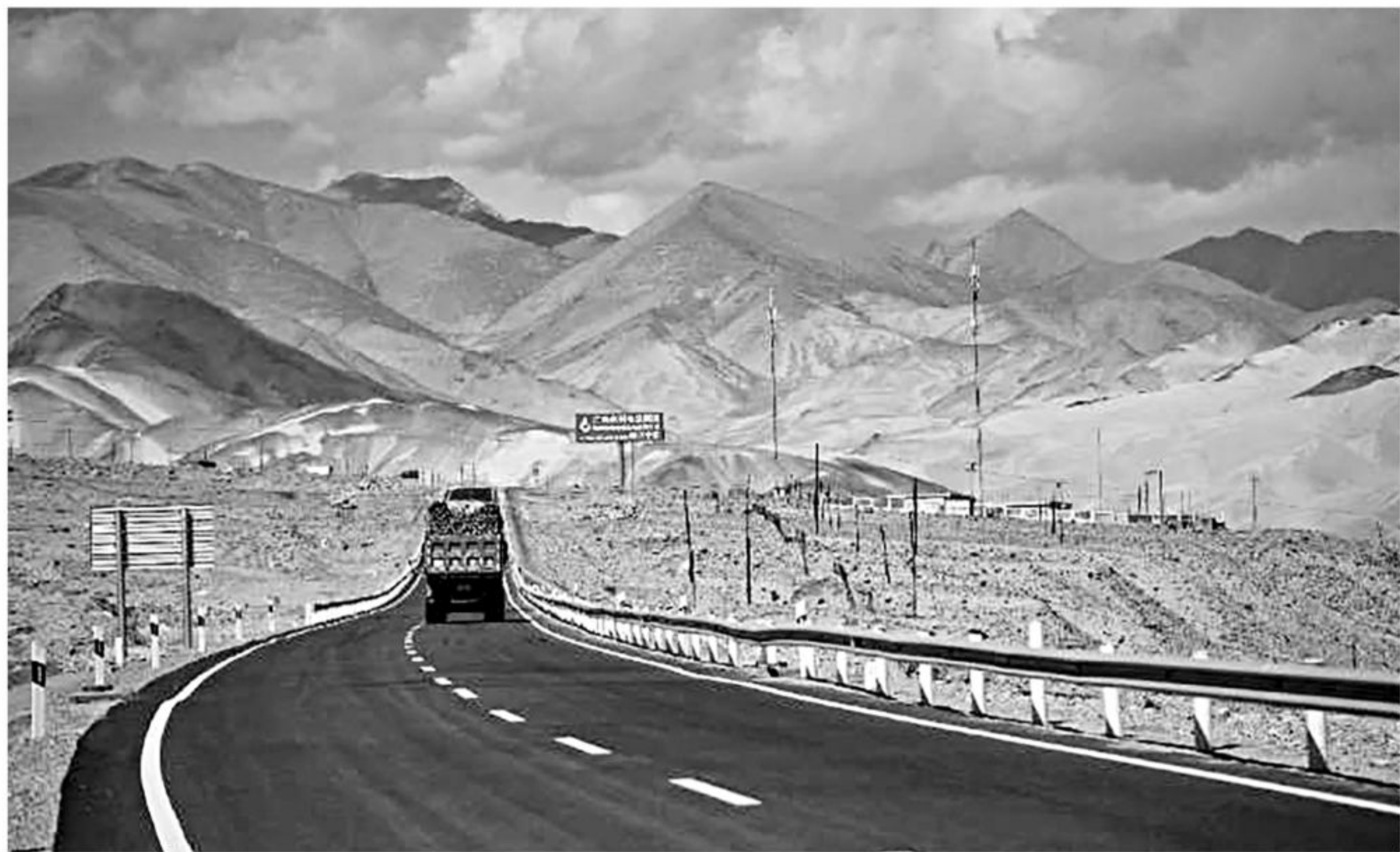
The China-Pakistan Friendship Highway runs over 1,300 kilometres (800 miles) from the far western Chinese city of Kashgar through the world's highest mountain pass and across the border.

These facts were surely taken into consideration by our policymakers when Bangladesh got on to the OBOR bandwagon. And although it puts Bangladesh into somewhat of an awkward position with its large neighbour India that is opposed to the OBOR initiative, our policy has always been based on "friendship towards all and malice towards none." Bilateral relations between Bangladesh and India have never been so good and