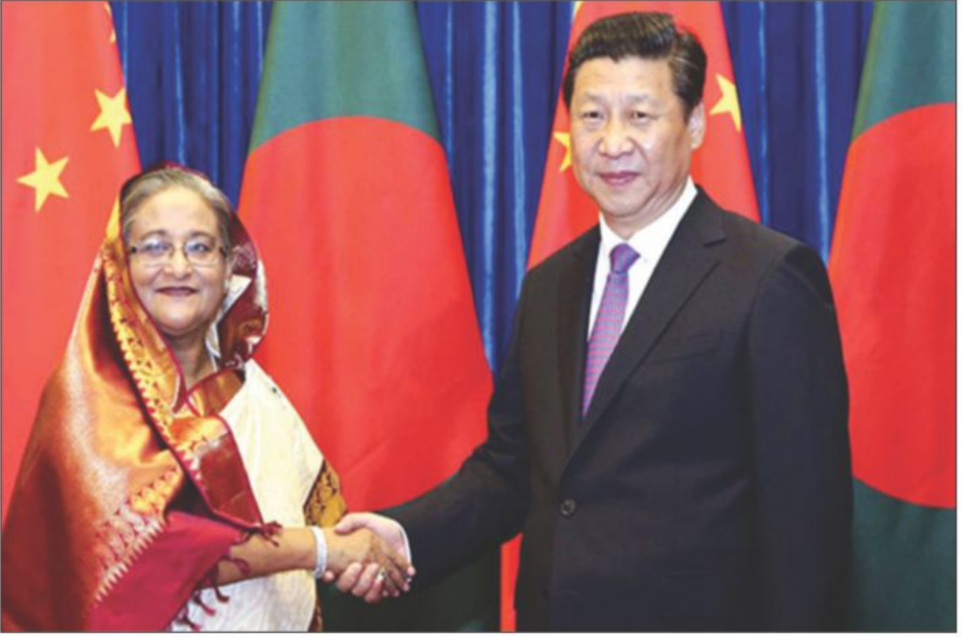
Bangladesh Prime Minister Sheikh Hasina shaking hands with Chinese President Xi Jinping

Independence, sovereignty, territory integrity and openness are the basic aim of Chinese foreign policy. China's foreign policies and behavior on the global stage have significantly contributed to the