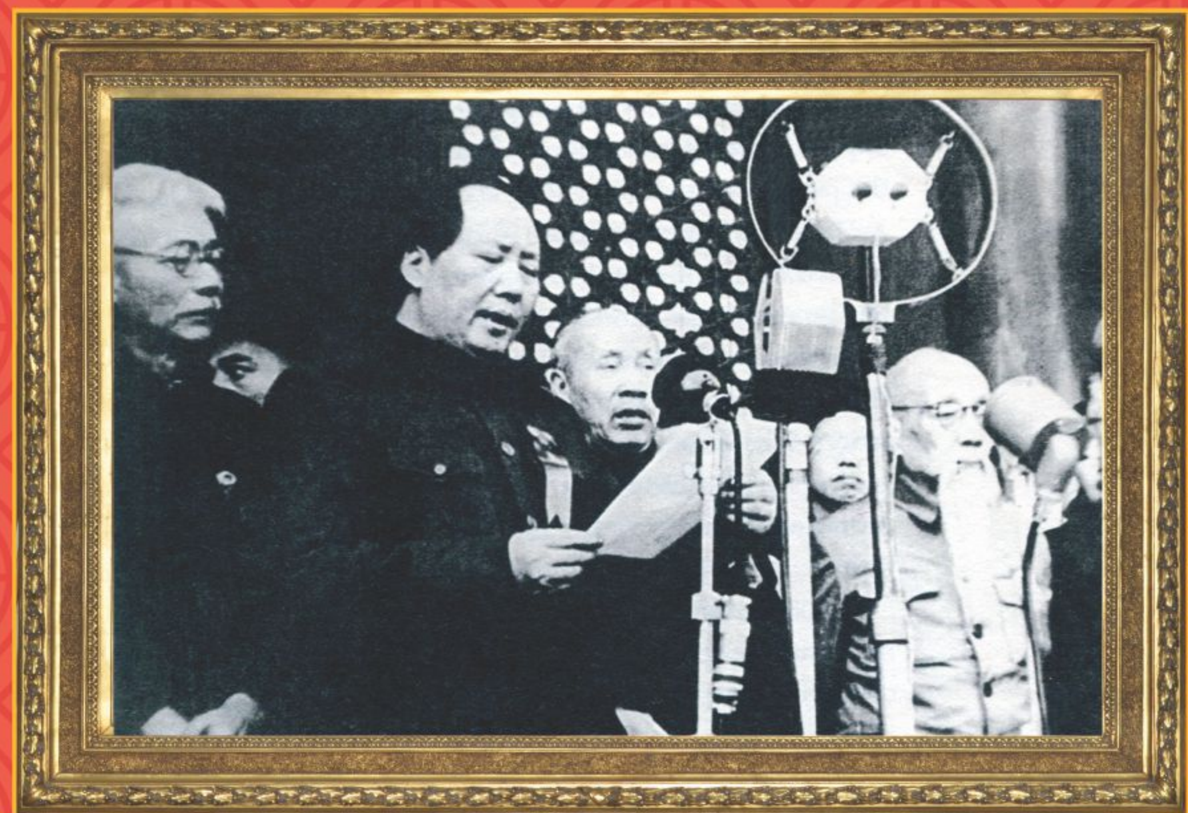
Chairman Mao Zedong delivers the proclamation of the Central People's Government of the founding of the People's Republic of China on Oct 1, 1949.

recent years the economic and trade ties between China and Bangladesh have considerably developed with gradual expansion in cooperation fields. The bilateral relations witnessed smooth development, with more consolidated friendly cooperation in various areas of politics, economy, and culture.