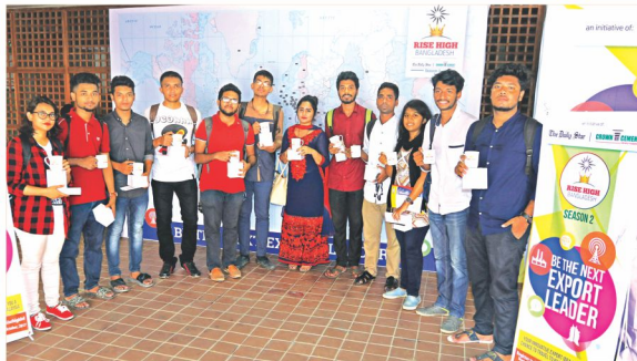
As part of its campus activation programme, the export idea contest "Rise High Bangladesh" covered East West University in the capital yesterday. Puzzle winners pose on the campus. The campaign will be held in 15 universities all over the country.